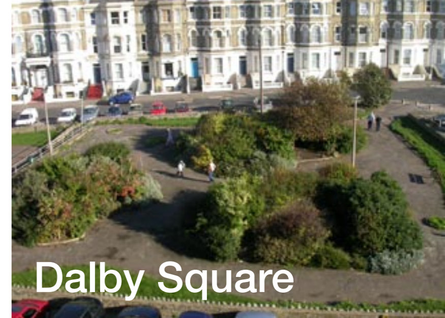
Set for a new look Dalby Square as it is now.