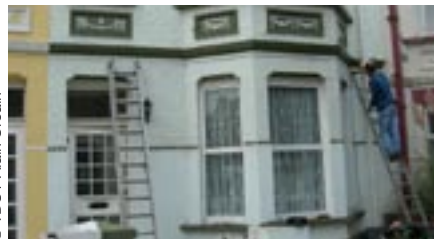
Work gets underway...

that they can apply for them. That's not the case at all. The grants are available to everyone and it's been very nice to have the help from the Council to improve things."