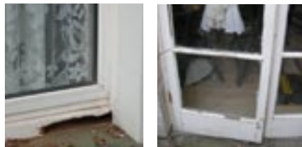
In need of repair – Sam's property before work started.

Sam Bryant from Warwick Road is one of the first to have work completed thanks to the grant scheme. The front of her house has been repainted, window frames have been repainted and the French doors at the back of her house have been replaced, giving the family more security. And Sam's pleased with the work that's been done. "I've had some lovely comments from neighbours and how smart and clean the house looks now. The work has made a big difference - we feel more secure thanks to the new French doors. A lot of people have asked me about the grants and don't seem to think