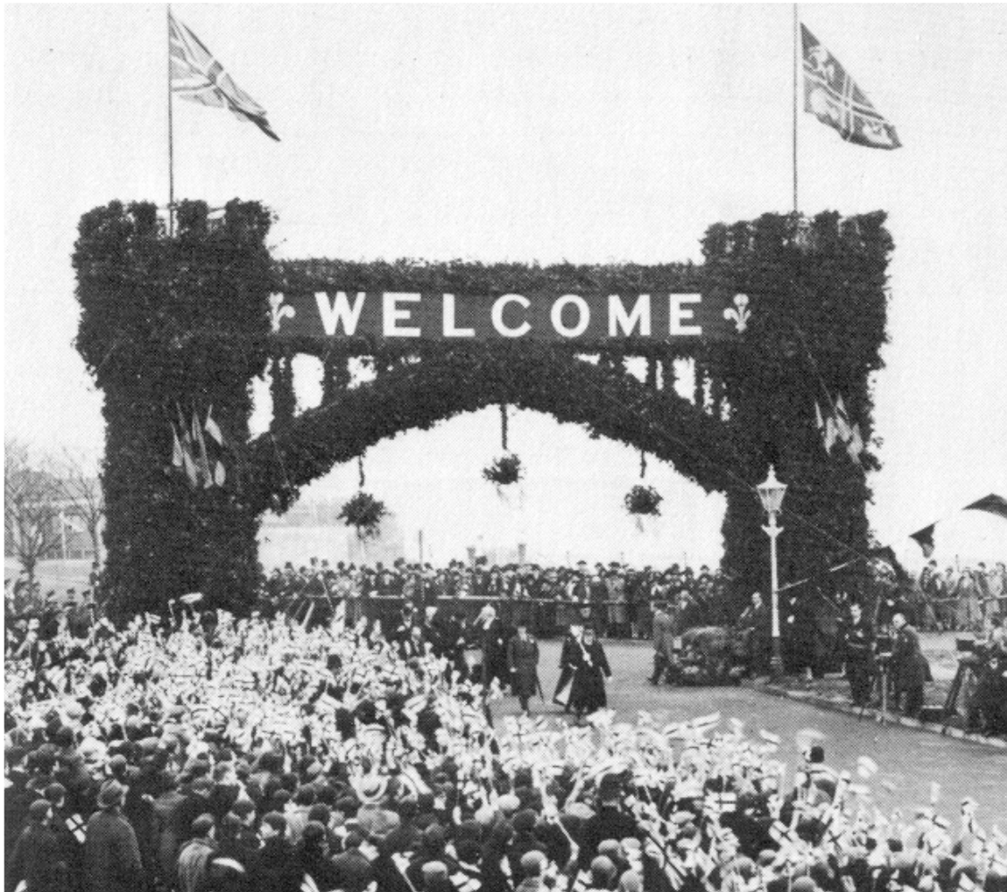
THE PRINCE OF WALES OPENS THE PRINCE EDWARD PROMENADE, WEST CLIFF, RAMSGATE 1926