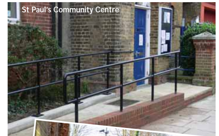
St Paul's Community Centre

The Centre hosts many activities and has space for more. For more information call 01843 224957.