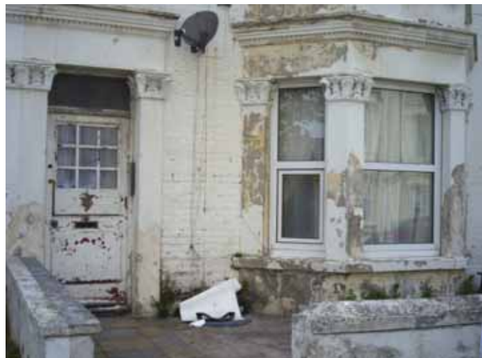
Gordon Road, before and after

The Renewal Grants are being offered to improve housing and environmental issues within the declared Renewal Area in Margate Central and Cliftonville West. With this in mind the Renewal Team will focus on works that will improve the overall appearance of your property and the local street