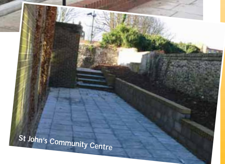
St John's Community Centre