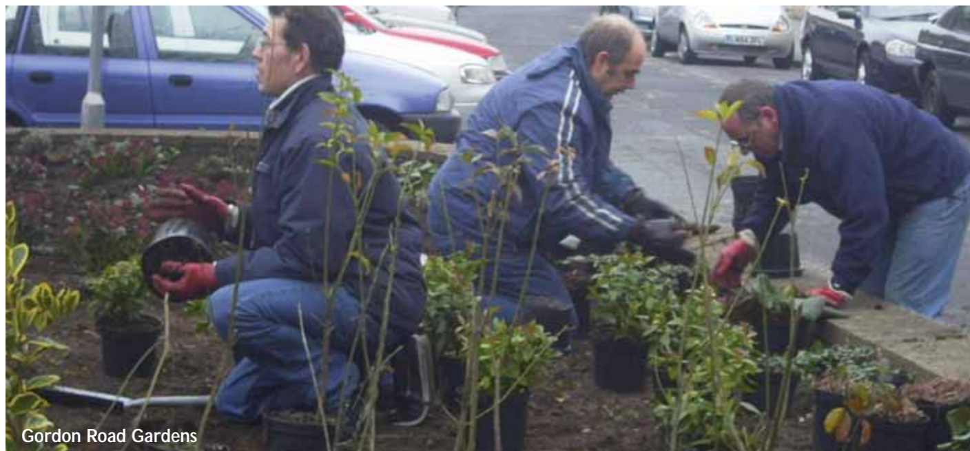
Gordon Road Gardens