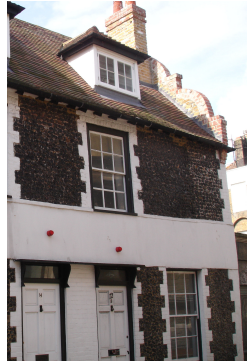
12b King Street