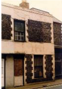
12b King Street