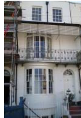
3 Kent Terrace