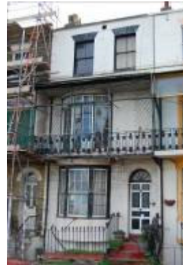
3 Kent Terrace