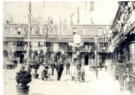
1-5 Kent Terrace