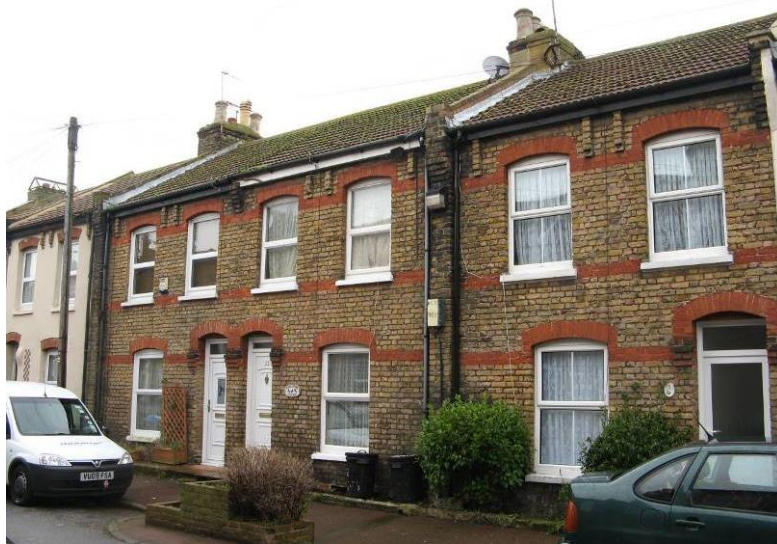
Houses in Grotto Road

Grotto Road contains more mixed building types with smaller cottages (just one window wide) along the south side and one much larger mansarded house (Davenport House, No. 44) which lies at the eastern end of this group. On the opposite side of the road, the buildings are again built using brown brick with red brick dressings but are double-fronted, so they are three windows wide. Apart from Davenport House, they are all two storeys high.