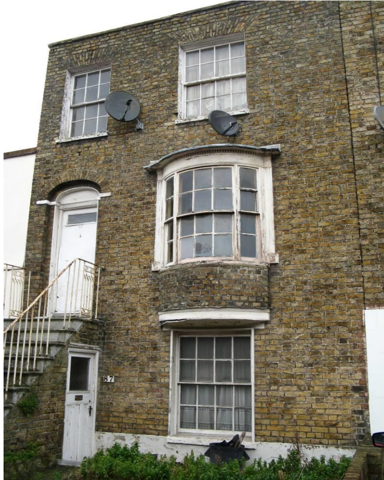
No. 87 Dane Road