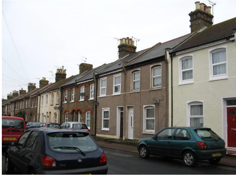
'Positive' terraced houses in Clifton Road

Proposals to demolish such buildings will therefore be assessed against the same broad criteria as proposals to demolish listed buildings. This implies therefore that all buildings marked as 'positive' on the Townscape Appraisal Map will be retained in the future, unless a special case can be made for demolition.