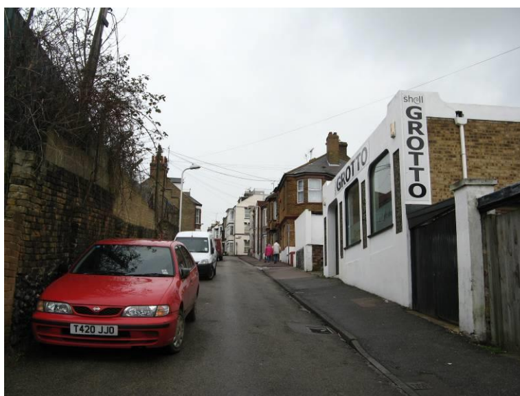
View up Grotto Hill past the entrance to the listed grotto

Margate is located over solid chalk, with high chalk cliffs rising to either side of the beach and harbour in the centre of the town. The Dane Valley rises gently southwards through the town from this beach. Cliftonville, to the north of Northdown Road, lies on roughly level ground on the eastern cliff tops above the town about 20 metres above sea level, although cuts have been made through the cliffs in previous centuries to allow access to the sandy beaches below. Two of these, Newgate Gap and Hodges Gap, lie within the Cliftonville Cliff Top Conservation Area. A slight south to north drop in level reinforces the opportunities for long views over the seascape to the north of these cliffs.