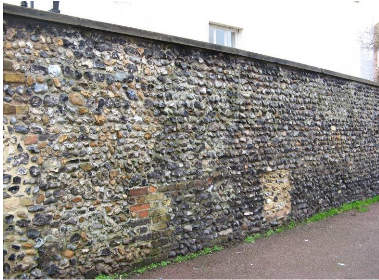
Beach flint wall in Clifton Place

Most of the buildings in the three main streets – Clifton Road, Brockley Road and Grotto Road – sit close to the back of the pavement with a very narrow strip of land about one metre wide separating the building from the public areas. In Clifton Road, these are largely paved over with a varied assortment of paving materials and there are also recent boundary treatments such as low concrete block or brick walls. Occasionally, low hedging or a little planting has been grown which softens the views along the road. Similar arrangements can be seen in front of the properties in Brockley Road and on the north side only of Grotto Road. The houses in Grotto Gardens sit up from the street with raised front gardens about three metres wide. These are defined by brick walls, many of them painted, with stone triangular copings. In places, the original cast iron railings, which were fixed on top of these walls, remain. The railings consist of a lower and bottom rail, with decorative details including the supporting posts.