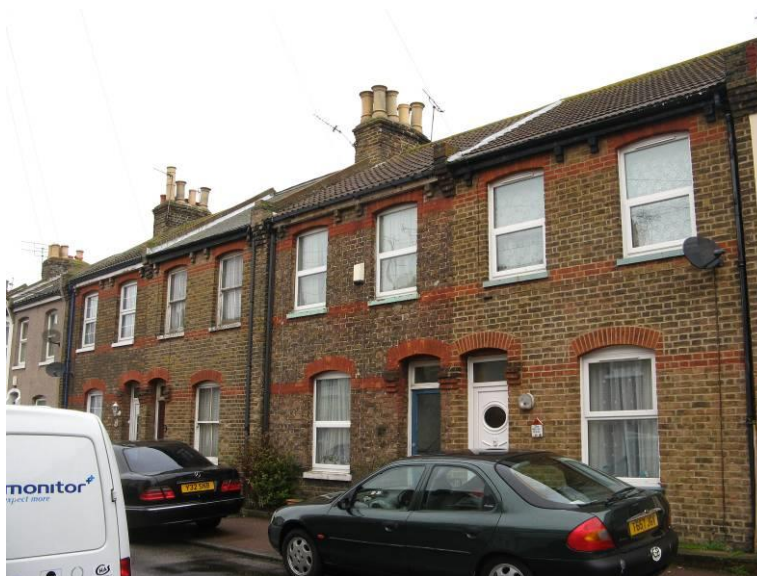
No. 19 Brockley Road (on left) is one of the few houses to retain its original windows

Any proposal to consider removal of Permitted Development rights and carry forward a decision to proceed with an Article 4 Direction will result in further public consultation and assessment. The Council may take these forward in due course if a strong justification and public support following further monitoring and recording change of the conservation area show to be necessary.