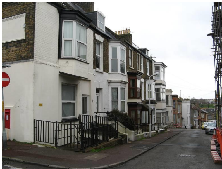
View down Grotto Hill

The Clifton Place/Grotto Gardens Conservation Area forms part of the distinctive grid pattern of streets which were developed in the late 19 th century as part of Cliftonville, a residential suburb located on the eastern edge of the old fishing village of Margate. Between 1880 and 1910 Cliftonville became a very popular and upmarket centre for visitors, who were drawn to its many hotels and guest houses, all located in close proximity to the beach. Large private houses and several schools were also built in the area. Accommodation was needed for the many workers who serviced these facilities and from the 1860s onwards new artisan houses were built on the south side of Northdown Road in a compact area overlooking the Dane valley. These houses are terraced in form and generally just two storeys high with small back gardens. Together, they form an area of distinct character which is enlivened by the inclusion within the Conservation Area of a large former Ice Factory and Cold Store, which is located on the corner of Grotto Hill and Bath Place. Of note is the falling topography, with a steep drop down Grotto Hill providing long views across the Dane Valley.