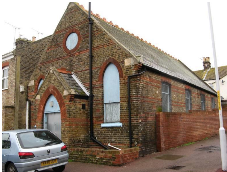
Hall in Brockley Road

The District Council has a Heritage Lottery Fund funded Townscape Heritage Initiative grant scheme in the Dalby Square Conservation Area. It is possible that this scheme could be extended, or a new scheme applied for the Clifton Place/Grotto Gardens Conservation Area at some stage in the future. Other funding agencies, apart from the HLF, include Historic England, Thanet District Council, Kent County Council and the Homes and Communities Agency (HCA).