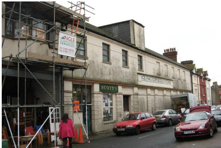
The former Ice factory and Cold Store, now used as an antiques and furniture shop

The Conservation Area is principally in residential uses, with most of the properties being modestly sized terraced houses which line all of the six streets which make up the Conservation Area. Whilst a detailed survey has not been carried out, the majority of the properties appear to be in use as family houses rather than as flats or HMOs (Houses in Multiple Occupation).