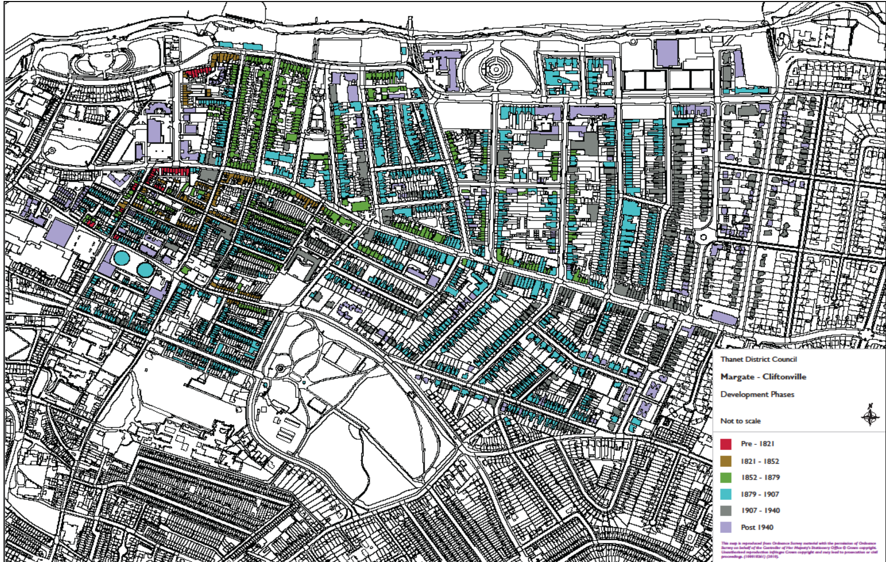
Appendix 1 Map 1 Cliftonville Development Phases