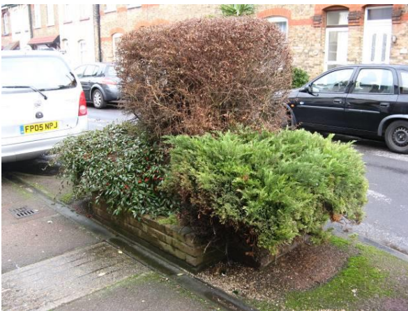
'Build-out' in Clifton Road