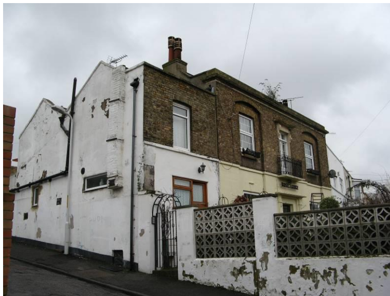
Rose Lodge is in urgent need of improvements