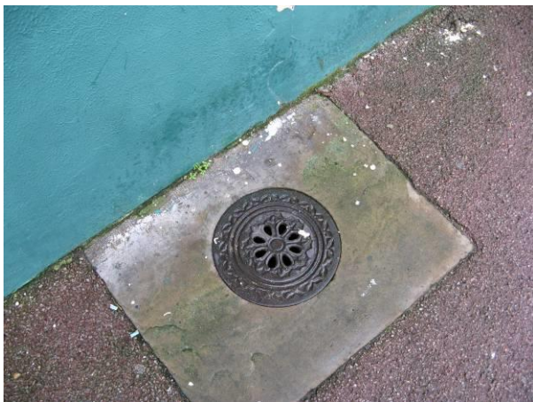
Cast iron coal hole in Grotto Road

Street lighting is modern and functional, with medium height steel standards. Overhead wires and telegraph poles are dominant in several locations. Street nameplates are usually modern, with white lettering on black background (or vice versa), and are often fixed to the buildings. Brockley Road retains an example of one of the 'Cliftonville' type nameplates made of cast iron with rounded edges, which can be seen at the western end of the road close to the junction with Grotto Hill. This matches other examples which can be found throughout Cliftonville and presumably date to the late 19 th century.