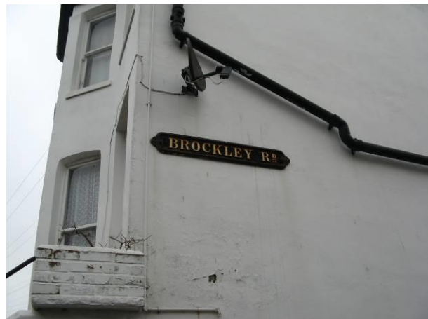
Historic nameplate in Brockley Road