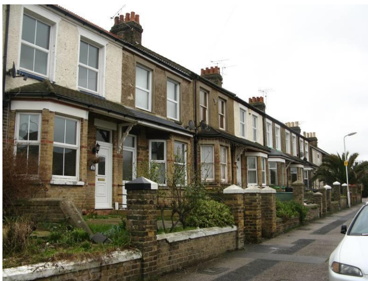
Houses in Grotto Gardens

Subject to public consultation, it is anticipated that the Clifton Place/Grotto Gardens Conservation Area could be designated during 2016 by Thanet District Council. Other conservation areas may be designated in Cliftonville as part of a review of the Cliftonville area which commenced in the summer of 2010. This Character Appraisal and Management Plan will be subject to an eight week public consultation between 11 January 2016 to 7 March 2016 after which any necessary amendments will be made to the document and the accompanying mapping. The final Appraisal and Management Plan will be approved by the Council in due course as a material document for development management purposes.