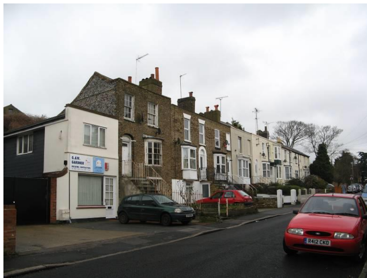
Houses in Dane Road

The terrace of houses in Grotto Gardens sit back and slightly up from the road with pebble dashed elevations (left a natural mid brown or painted white to cream) and ground floor bay windows with roofs which continue over the front door to provide an open porch. Upstairs, each house has two windows with a pitched slated or tiled roof above. No. 4 Grotto Gardens retains its original two over two sash windows and what appears to be the original front door with glazed up panels and two heavily moulded panels beneath. Otherwise, most of the windows, and many of the front doors, are uPVC. The terrace looks over the back elevations and slate roofs of a group of three linked early 20 th century brick buildings which were probably built for industrial or some other commercial purpose – one at least is used by the adjoining builders as a store, although the others appear derelict.