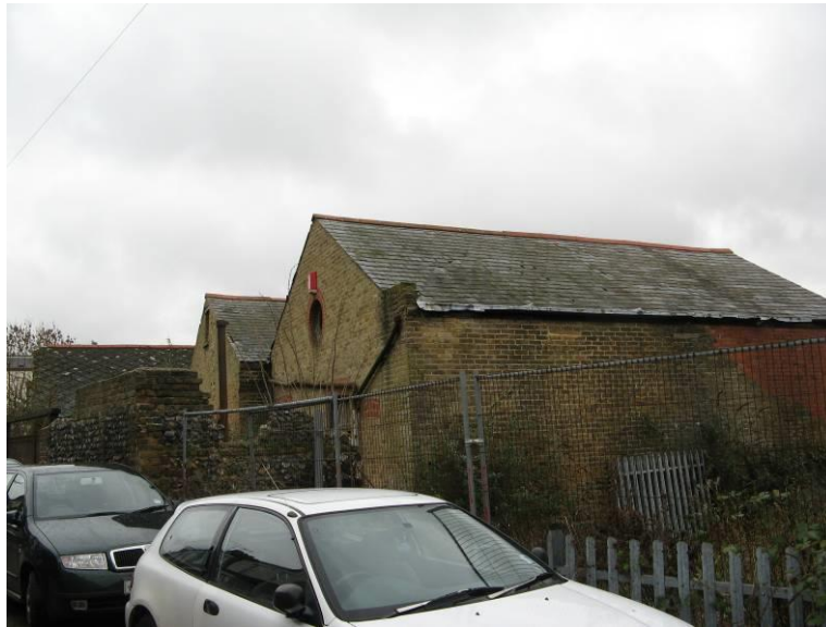
Former industrial buildings between Grotto Gardens and Dane Road

The closely packed nature of the buildings within the Conservation Area means that there are few, if any, sites where new development might be possible although the replacement (in time) of the poorer quality 20 th century buildings would be welcome. The only truly vacant site, at the end of Grotto Gardens, has recently been redeveloped with three terraced houses. The redevelopment of the industrial buildings between Grotto Gardens and Dane Road may come forward at some stage although at least one of the three buildings appears to be in use. Otherwise, there are no vacant sites so it is likely that new development will be limited to extensions to existing buildings or the replacement of these modern buildings. In a number of locations, flank walls, flat roofed garages, and poorly maintained back access alleys make a particularly negative contribution to the street scene.