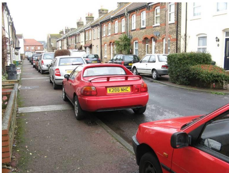
Parking on the pavements in Clifton Road

On-street car parking is predominant throughout the Conservation Area, with clearly not enough spaces for the number of residents' vehicles. It may be possible to reduce the impact of on-street car parking by the creation of carefully designed parking bays, which could incorporate planting and new street trees (as suggested in para 3 above). However, any such scheme would need to be allied to improvements in Cliftonville in general, including (possibly) the introduction of a Residents' Parking Scheme. The existing road system should be retained. Over-dominant road markings, barriers, and safety rails must all be avoided as these are alien intrusions in any conservation area.