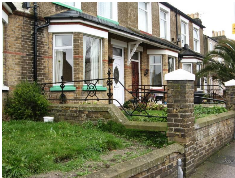
Gardens in Grotto Gardens with original cast iron railings

Most of the buildings in the three main streets – Clifton Road, Brockley Road and Grotto Road – sit close to the back of the pavement with a very narrow strip of land about one metre wide separating the building from the public areas. In Clifton Road, these are largely paved over with a varied assortment of paving materials and there are also recent boundary treatments such as low concrete block or brick walls. Occasionally, low hedging or a little planting has been grown which softens the views along the road. Similar arrangements can be seen in front of the properties in Brockley Road and on the north side only of Grotto Road. The houses in Grotto Gardens sit up from the street with raised front gardens about three metres wide. These are defined by brick walls, many of them painted, with stone triangular copings. In places, the original cast iron railings, which were fixed on top of these walls, remain. The railings consist of a lower and bottom rail, with decorative details including the supporting posts.