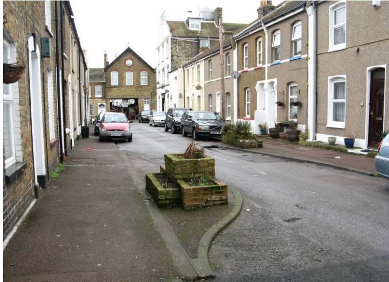
View along Grotto Road

Views along Clifton Road, Brockley Road, and Grotto Road are enclosed by the terraced houses on either side of each street with no special focal points. Brockley Road does contain a small former chapel or hall, and Grotto Road similarly contains the slightly taller Davenport House, both of which add some liveliness to the otherwise very simple front facades. A gable on the brick part of the Ice Factory and Cold Store forms an end-stop to the view westwards along Grotto Road.