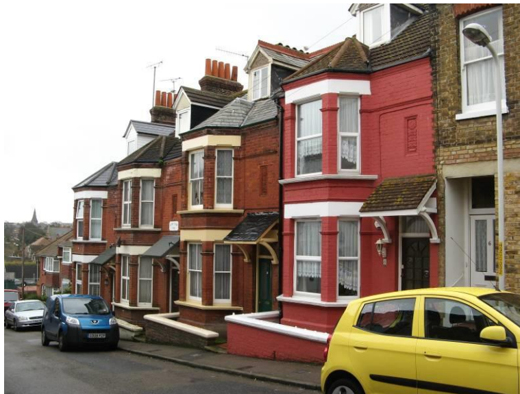
Unusual red brick houses in Grotto Hill

Grotto Hill retains some good examples of far more varied late 19 th century houses, two or three storeys high, as well as, at the top of the hill and opposite the junction with Brockley Road and Bath Place, the former Ice Factory and Cold Store. This is a very large corner building of two builds – facing Grotto Hill, the brown brick and gabled section has carved barge boards indicating a late 19 th century date (the adjoining houses are dated 1888), but facing Bath Place, the building is rendered with a string course and pilasters which are lined out to replicate stone. The effect is a kind of stripped-down classical which could well be the result of a refacing between 1910 and the 1920s.