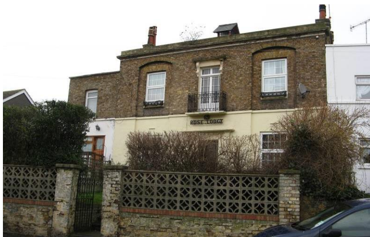
Rose Lodge, Dane Road

The map of 1872 confirms that by this date both sides of Clifton Road (then called Clifton Cottages) had been built, as had the south side of Grotto Gardens. Some of the properties on the east side of Clifton Gardens (probably Nos. 11-31 odd) are also shown. A large area of open space is shown where Brockley Road is now located. By 1899 this had been infilled, and date stones on some of the buildings in Grotto Hill of 1888 and 1892 confirm that this was a period of further expansion and infilling. The map of 1907 shows the area much as it is today, although Grotto Gardens was still a nursery – the terraced houses must have been added soon after. Of interest are the non-residential buildings – the former Ice factory and Cold Store off Grotto Hill, which is not shown on the 1907 map and stylistically dates to the period 1910 -1920, and some single storey workshops, now vacant and in poor condition, between Grotto Gardens and the properties facing Dane Road. These are also early 20 th century in date. At some stage a single storey hall was built in Brockley Road, possibly as a non-conformist chapel or some sort of community facility – its details suggest a late 19 th century date.