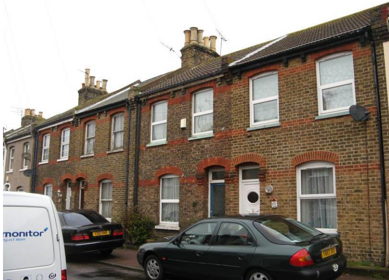
Well detailed houses in Brockley Road

Most of the buildings are terraced residential properties which date to between 1860 and the early 20 th century, although Grotto Gardens appears to be a little later – only Nos. 12-15 are shown on the 1907 map. The earliest houses can be found in Dane Road (Nos. 69-103 odd) and are shown on the 1845 map. The predominant building type is the small terraced house, two storeys high and two windows wide, with a pitched roof facing the street. Some, such as the houses in the northern end of Grotto Hill, Clifton Gardens, and Dane Road, have half basements and raised ground floors, and some have canted bay windows.