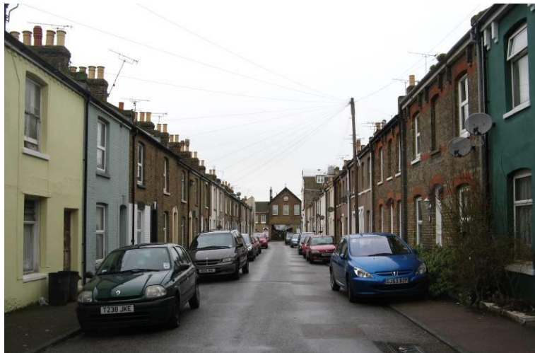
Terraced houses in Brockley Road

The Clifton Place/Grotto Gardens Conservation Area was built on open fields as part of the development of Cliftonville between the 1850s and late 19 th century, when the streets to either side of Northdown Road were laid out in a grid pattern, those on the north connecting the commercial core of Cliftonville with the seaside activities along the promenades. To the south, the streets which form the Conservation Area adjoined Bath Road, a long straight road which dropped down the hill from what was then called Northumberland Road (now Northdown Road), containing an area of very mixed development. The streets within the Conservation Area therefore follow the orientation of Bath Road and Northdown Road, creating a tightly planned series of short streets lying parallel to each other which are linked in the west by Clifton Gardens and its continuation, Grotto Hill. Whilst Brockley Road and Grotto Road are connected by a car-accessible street, the continuation of Grotto Road up the hill on the east side of the Conservation Area has been blocked up and a pedestrian-only route provided. Of note is the steepness of the south-facing slope, most obviously appreciated along Grotto Hill and this second section of Grotto Road, with the three main streets between them being roughly level as they follow the contours along this hill.