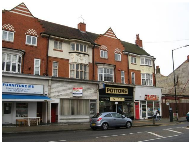
Early 20th century shops in Northdown Road

Nos. 39-41 Northdown Road, and just outside the Conservation Area to the east is a small Tesco's Supermarket and a petrol-filling station. Many of the upper floors of the shops appear to be used for residential purposes, but some are also used as offices or as storage for the shops below.