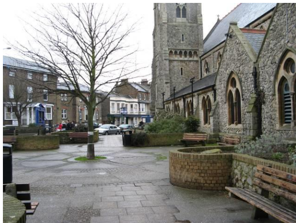
The landscaped area in front of St Paul's Church

Historically, the Northdown Road area was always served by the wide open spaces and promenades which now lie within the Cliftonville Cliff Top Conservation Area (to the north) or the planned landscape of Dane Park, which was opened in 1897 (to the south). As a result, Conservation Area contains hardly any public open space apart from the (modern) landscaped area in front of St Paul's Church. This is paved, with raised brick planters, a number of semi-mature trees, and some public seating. An historic gas light, now converted to electricity, is of note at the entrance to the church. A small 'green' of grass and some semi-mature trees can be seen in Crawford Gardens, heavily compromised by unregulated car parking.