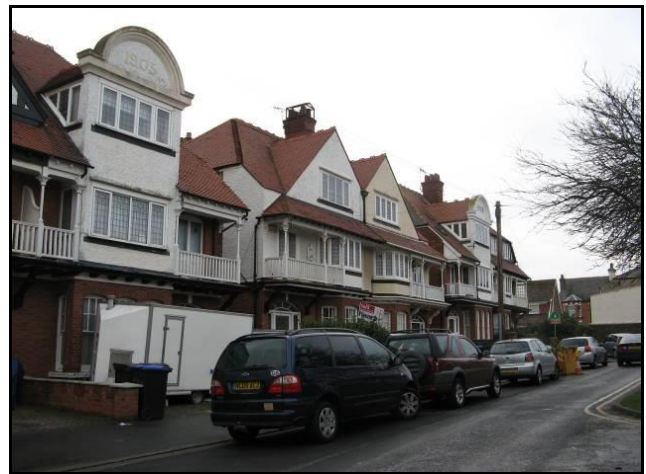
Arts and Crafts houses in Crawford Gardens

Despite the economic problems of Cliftonville, Northdown Road remains a vibrant and popular shopping area, with many of its customers travelling from outside to use its various facilities. These include branches of the national banks and building societies and a wide variety of shops including (just outside the Conservation Area) a small Tesco’s Supermarket. A number of public houses, cafes, and restaurants all add to the attractions of this part of Cliftonville.