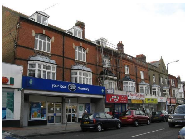
Nos. 182-192 even Northdown Road