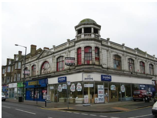
The former Snooker Hall, built in 1913

Descriptions of these buildings can be found in the Management Plan para. 2.6.