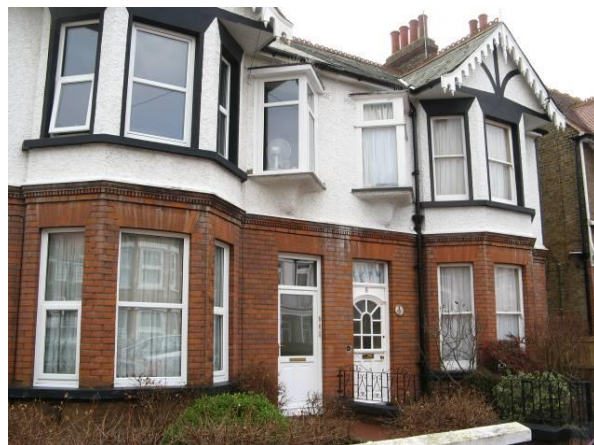
Houses in Lyndhurst Avenue