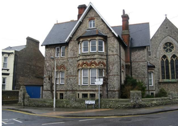
St Paul's Vicarage, Northdown Road

There are currently three listed buildings or building groups in the Conservation Area. St Paul's Church and its adjoining vicarage are both listed grade II. The church was built in ragstone between 1872 and 1873 to the designs of R K Blessley of Eastbourne, although it was completed by R Wheeler. The vicarage is also by Blessey and was similarly completed in 1873. Both of these buildings are key buildings within the Conservation Area.