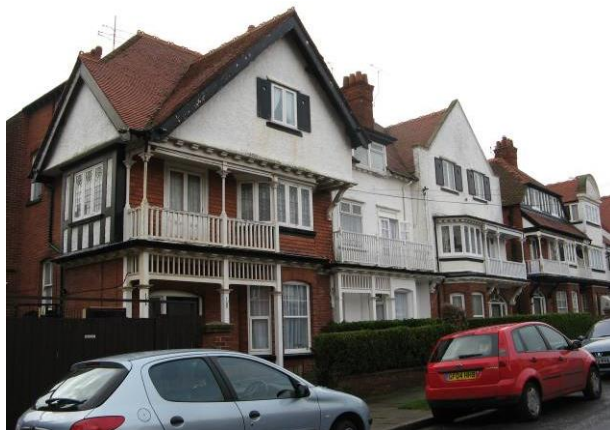
Houses in Crawford Gardens

Conservation Area as many of the residential properties are not in use as family dwellings (i.e. as a single unit) but have been divided into flats or HMOs. Even more buildings are in mixed uses i.e. retail to the ground floor, and possibly BI (offices) or residential above. For these buildings, permitted development rights are already much lower, so, for instance, planning permission would normally be needed to insert new plastic windows or to change the roof material. For these buildings, an Article 4 Direction could still be used to control front boundaries, the creation of car parking spaces, and external redecoration.