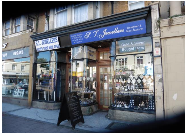
Historic shopfronts in Northdown Road