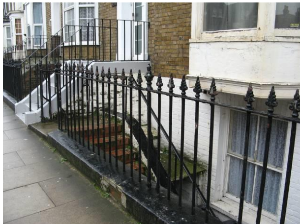
19 th century railings in Northdown Road

Cliftonville has also been identified as important part of the local heritage by officers of the District Council, by Historic England (this Appraisal was in the main grant funded by Historic England), and by the local community, which has been consulted on initial drafts of this document.