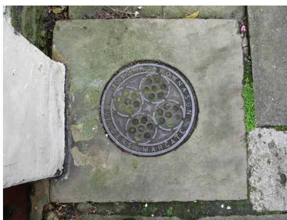
Cast iron coal hole cover, Clarendon Road

A few properties have modern boundaries of no merit – these include No. 78 Northdown Road, which is fronted by a low wall built out of concrete blockwork.