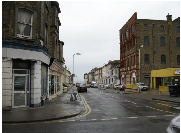
View down Athelstan Road to the sea