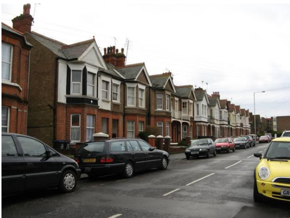
Houses in Wyndham Avenue

Of note are the well preserved terraces of quite modest late 19th century houses in Wyndham Avenue and Lyndhurst Avenue, with their red brick or pebble-dashed facades, pitched tiled or slated roofs, and sash windows set in double height canted bays which are surmounted by gables which face the street. Some of the original six over one sash windows remain, the design suggesting a date of c.1910 (they are not shown on the 1905 map, when this part of Cliftonville was still fields).