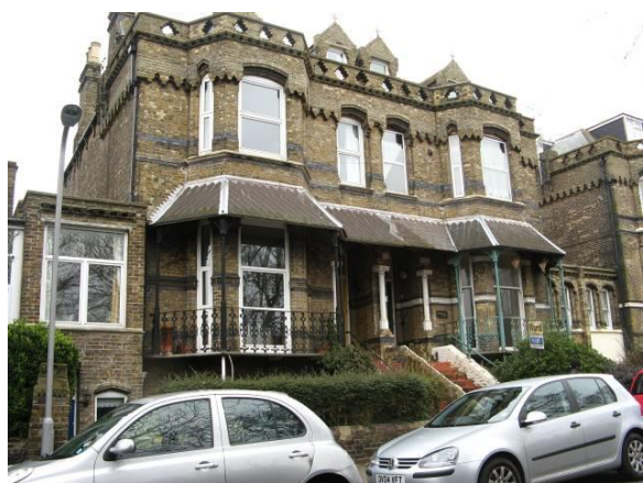
Houses in Clarendon Road