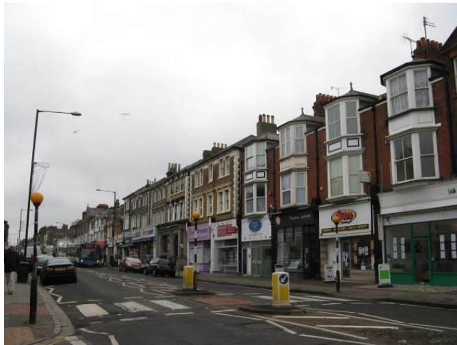
Shops of the 1870s in Northdown Road

The control and enhancement of these shopfronts is further discussed in the Management Plan.