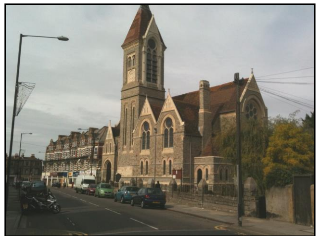
The spire of St Michael and St Bishop's Church is a key focal point