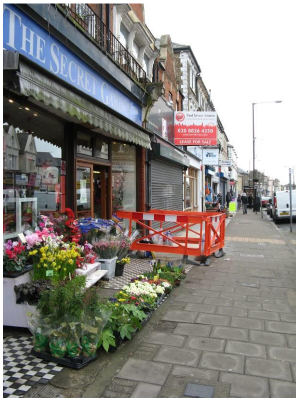
The Secret Garden, Northdown Road

Pavements are mainly covered in black tarmacadam or concrete slabs or concrete paviors. An enhancement scheme was carried out in part of Northdown Road some time ago, providing parking bays, widened pavements, and areas of higher quality paving. Some of the shops appear to own their immediate forecourt as there are changes of materials in many locations, all adding to the overall feeling of clutter, although occasionally, such as outside The Secret Garden, this is a positive thing as the shop owner uses the forecourt to display a range of flowers and plants.