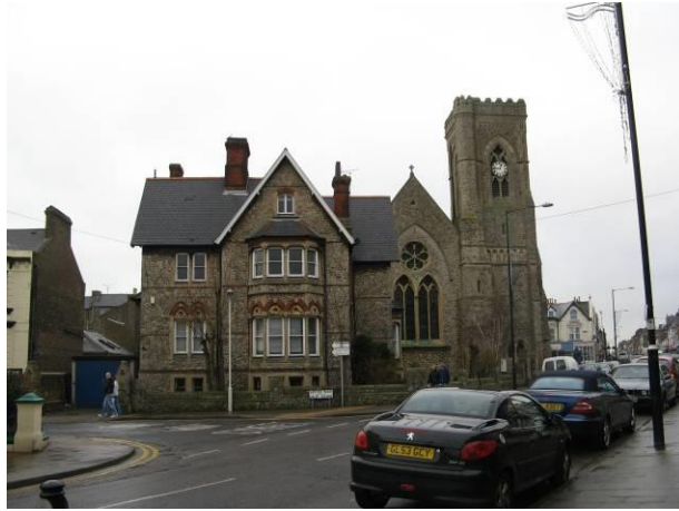
St Paul's Vicarage and the church beyond date to the 1870s

Cliftonville continued to thrive until World War 2, and Dalby Square particularly was noted for the prestigious hotels, guest houses and convalescent homes which fronted it. However, the War saw the evacuation of schools to other parts of the country and most never returned. Warrier Crescent suffered bomb damage and was only partially reconstructed after the War – it was finally demolished in its entirety in 1988.