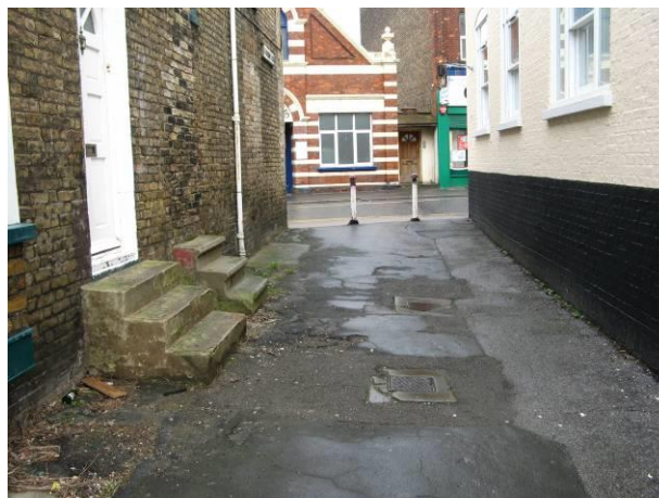
Further improvements to the public realm are needed in Northdown Road

A new public realm strategy would be beneficial, ideally in partnership with a new grant scheme, to improve the public realm in the Conservation Area and, ideally, in the whole of Cliftonville. The public realm includes all of the space between the buildings in the Northdown Road Conservation Area which is not privately owned, such as the roads, pavements, street lighting, street name plates, and street furniture (litter bins, seats, and other features). Whilst a small part of Northdown Road has already been improved, with widened pavements and some new paving, the work was carried out some time ago and further enhancements are needed. Grant aid for some of this work from either Historic England or the Heritage Lottery Fund might be available for some of this work.