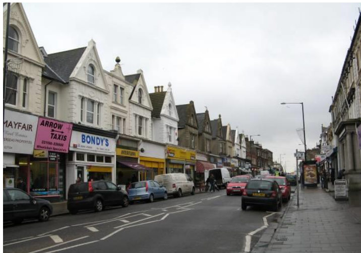
View along Northdown Road

Until recently, Thanet District Council's main impetus, in partnership with the Margate Renewal Partnership, has been to regenerate the town centre of Margate. Relevant documents include a Strategic Urban Design Framework, which was produced in 2004, and an Action Plan for Margate, produced in 2005. One of the outcomes has been that buildings in the Old Town have been subject to a variety of grant schemes including a Townscape Heritage Initiative scheme between 2003 and 2008 which provided over one million pounds of funding. A similar scheme is also operating in the adjoining Dalby Square Conservation Area. Other initiatives include the recent opening of the Turner Contemporary art gallery and of Dreamland. Several key development sites have also been identified, including the Lido and its adjoining car park.