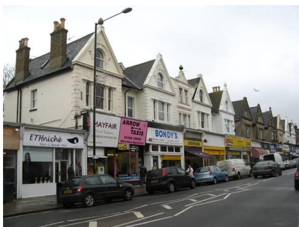
Magdala Villas, Nos. 99-125 odd Northdown Road