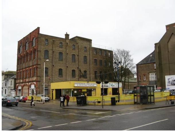
The car wash off Athelstan Road