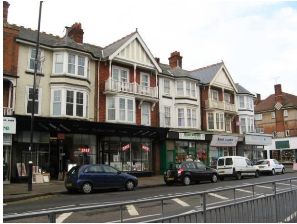
Well detailed purpose-built shops in Northdown Road

This document provides a detailed analysis of the special interest of the Northdown Road Conservation Area and records those features which make the Conservation Area worthy of designation (the 'Character Appraisal'). It also provides proposals for enhancements (the 'Management Plan'), most of which will be the responsibility of either Thanet District Council or Kent County Council (as Highways Authority). All of the recommendations will, of course, be subject to funding and staff resources being made available.