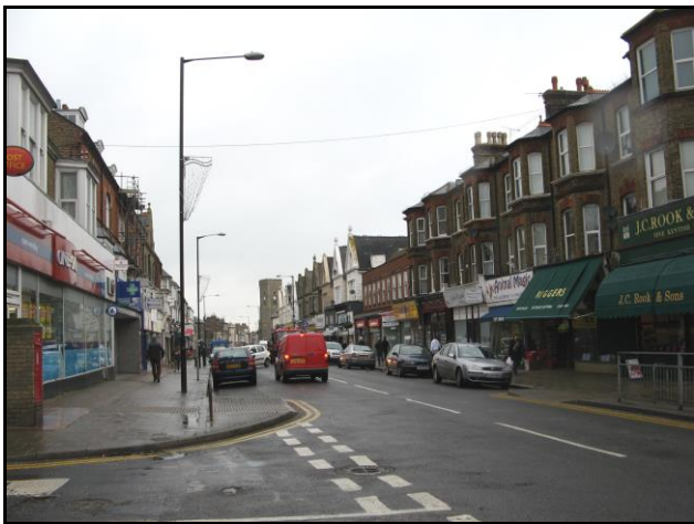
Shops along Northdown Road

Northdown Road forms a linear ‘spine’ to the seaside suburb of Cliftonville which lies to the east of the older settlement of Margate. It connects further conservation areas which lie to the north and south of it. Whilst the western end of Northdown Road retains some buildings which are shown on the 1821 map, the majority of the buildings in the Conservation Area are commercial premises which were largely built during Cliftonville’s heyday between the 1870s and the early 20th century to provide goods and services to the area’s many visitors and residents. It is notable for its rows of well detailed shops, which are interrupted by individual buildings such as St Michael and St Bishoy’s Church (the former St Stephen’s Wesleyan Methodist Church). Nearby, St Paul’s Church and its vicarage (listed in 2010) are further landmark buildings. There are also terraces of well detailed late 19th or early 20th century houses, the most notable being the Arts and Crafts houses in Crawford Gardens and a pair of similarly-dated houses in Prices Gardens.