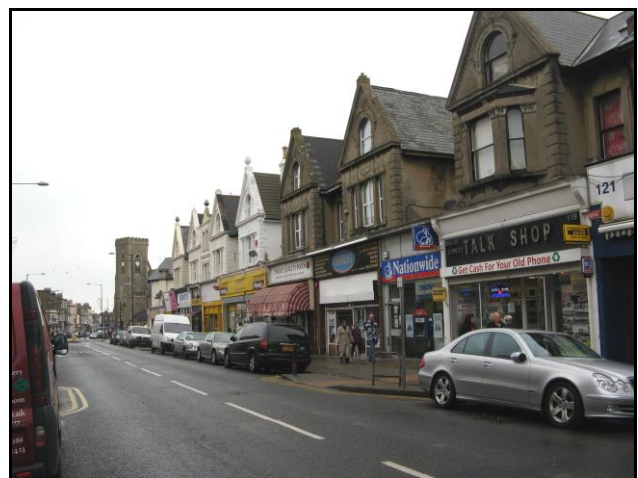
Views of the two churches along Northdown Road