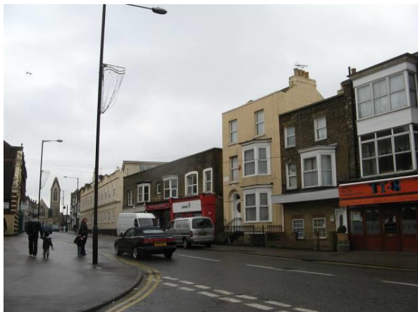
These properties at the western end of Northdown Road date to the mid 19th century

unaltered although modern shopfronts have often been inserted and many have had their original windows replaced using modern materials. The overall style is Italianate, with sash windows and parapets which conceal the slated roofs, and some properties in the western end of the street, such as Nos. 86, 88 and 90, which date to 1857 (date plaque) have or had first floor balconies with their original cast iron railings. No. 82 retains a similar balcony but this time the railings are far more decorative.