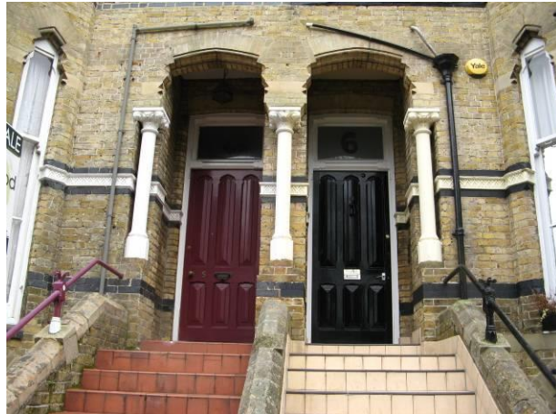
Detail of the front doors, Clarendon Road

Nos.1-8 consec. Clarendon Road – these are shown partly built on the 1879 map and are an unusual example of stock brick three storey houses with Gothic details including pointed window heads and pierced parapets. The raised ground floors are accessed by paired steps with cast iron railings. Nos. 1 and 2 have ground floor verandas with cast iron railings and cast iron columns which support roofs covered with fishscale slates. Many of the original heavily moulded panelled front doors remain.