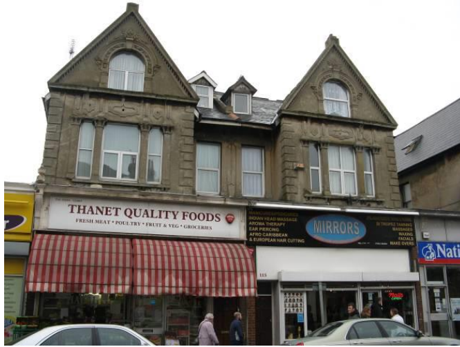
Grant aid would help preserve these historic buildings for future generations