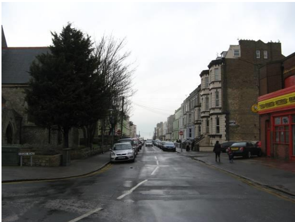
View from Northdown Road towards the sea along Edgar Road

The Conservation Area lies within the Cliftonville West Ward of Thanet District Council. The area of Cliftonville is in the region of 120 hectares and the population (at the 2011 census) was 7,608. Demographically, the population is predominantly white European.