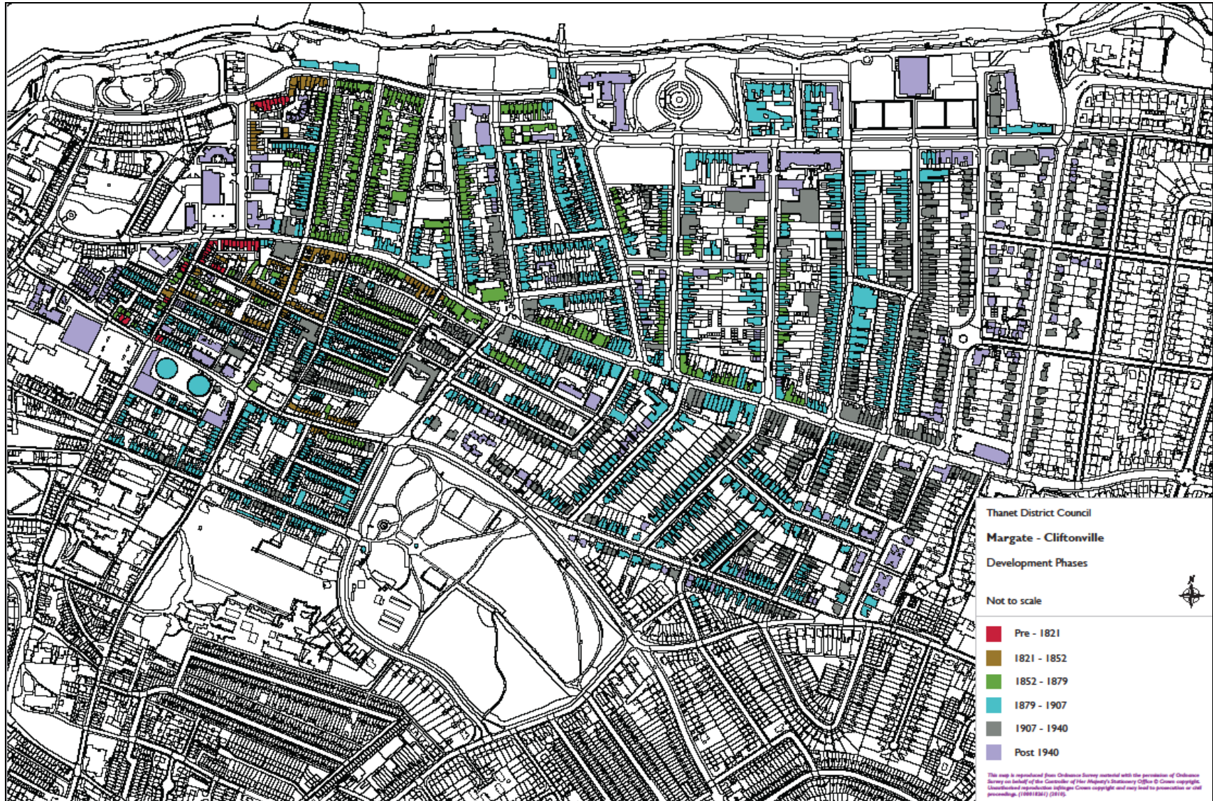
Appendix 1 Map 1 Clintonville Development Phases