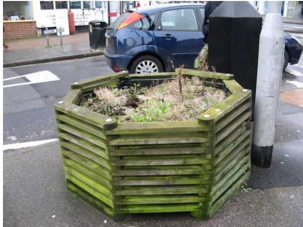
Examples of the poor quality public realm in Northdown Road

Pavements are mainly covered in black tarmacadam or concrete slabs or concrete paviors. An enhancement scheme was carried out in part of Northdown Road some time ago, providing parking bays, widened pavements, and areas of higher quality paving. Some of the shops appear to own their immediate forecourt as there are changes of materials in many locations, all adding to the overall feeling of clutter, although occasionally, such as outside The Secret Garden, this is a positive thing as the shop owner uses the forecourt to display a range of flowers and plants.