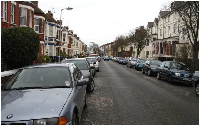
Car parking is a dominant feature in the Conservation Area (Norfolk Road)

On-street car parking is highly dominant throughout the Conservation Area. It may be possible to reduce the impact of on-street car parking by the creation of carefully designed parking bays, which could incorporate planting and new street trees (which are currently only found in Norfolk Road). However, any such scheme would need to be allied to improvements in Cliftonville in general, including (possibly) the introduction of a Residents' Parking Scheme.