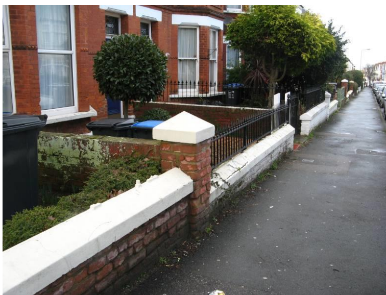
Front boundaries in Norfolk Road show evidence for earlier cast iron railings

The orientation of the buildings to the street mean that virtually every building (unless modern extensions intrude) has a small front garden, usually about three metres deep, which provide an opportunity to plant small trees and shrubs. These gardens are usually defined by low (about 600 mm high) red or brown brick boundary wall with simple triangular or rounded white painted stone copings. Boundary piers and gate piers are taller and are also topped by white stone copings. In some locations, carefully trimmed hedging can be seen behind these low walls.