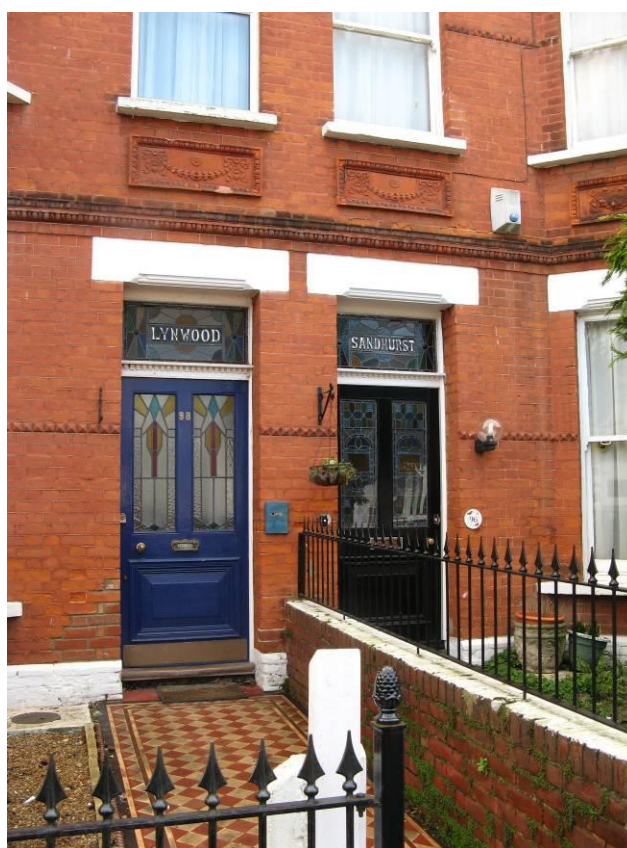
Front door details – Norfolk Road west side

Norfolk Road, Warwick Road and Surrey Road form part of the distinctive grid pattern of streets which were developed in the late 19 th century as part of Cliftonville, a residential suburb located on the eastern edge of the old fishing village of Margate. Between 1880 and 1914 Cliftonville became a very popular and upmarket centre for visitors, who were drawn to its many hotels and guest houses, all located in close proximity to the beach.