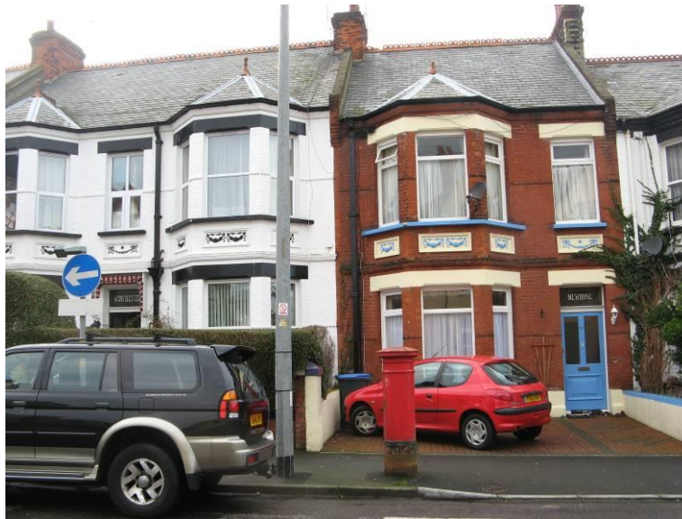
The front garden to this property in Norfolk Road has been converted into a car parking space

The closely packed nature of the buildings within the Conservation Area means that there are few, if any, sites where new development might be possible although the replacement (in time) of the poorer quality 20 th century buildings would be welcome. There are no vacant sites so it is likely that new development will be limited to extensions to existing buildings or the replacement of these modern buildings. In a number of locations, flank walls, flat roofed garages, and poorly maintained back access alleys make a particularly negative contribution to the street scene.