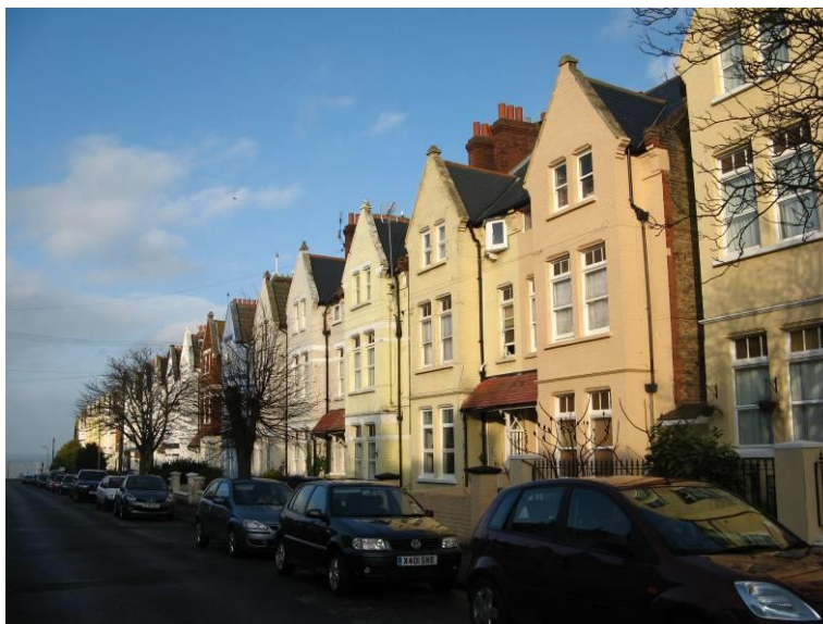
Nos. 3-49 Norfolk Road

decorative panels) and four over one sash windows. Again the front doors have fanlights. The roofs are covered in clay tiles rather than slate.