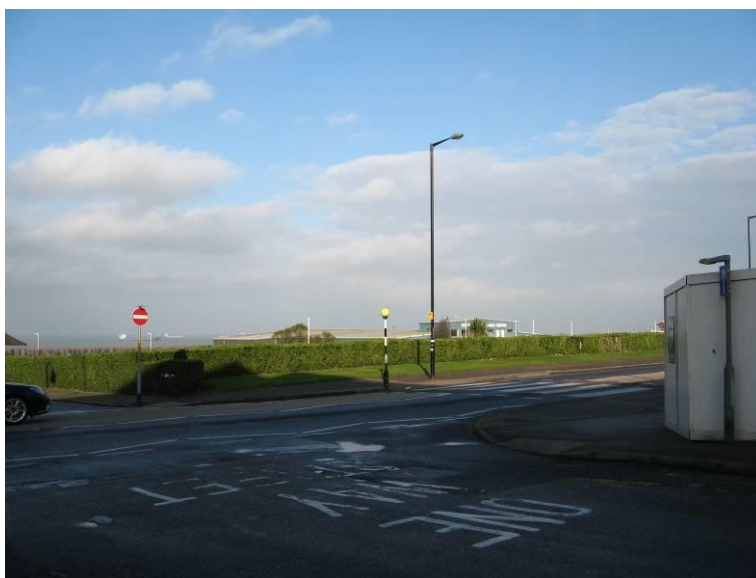
View towards the Thanet Indoor Bowls Club from the end of Surrey Road

The simple grid pattern of streets, and the cohesive mainly residential development on either side of each road, means that there are no focal points and that no one building particularly stands out.