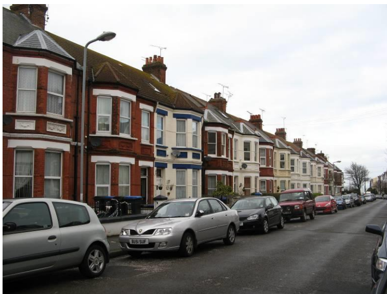
Norfolk Road – west side

Conservation Area designation is not intended to prevent change or adaptation but simply to ensure that any proposals for change are properly considered. Restoration of the historic built environment will not impede its regeneration, and, indeed, designation will enable the District Council as the planning authority to incrementally improve the appearance of the buildings and the spaces between them, providing an impetus for private investment. Further work is being done by the District Council under separate initiatives to encourage larger residential units and the creation of more owner-occupied property.