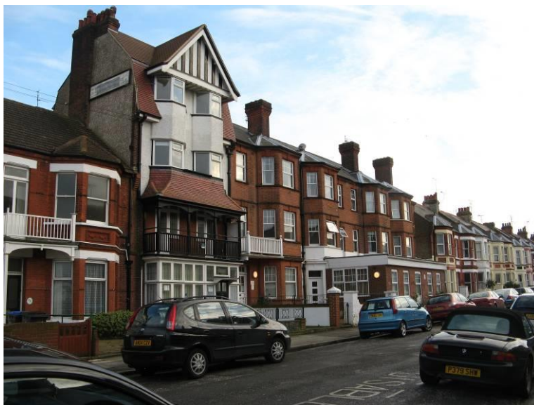
No. 15 Warwick Road on left

The buildings of Surrey Road are generally not so well detailed or well preserved as the other two streets, and also later in date. Nos. 2-24 are shown on the 1907 map but otherwise the remaining properties probably date from the 1920s (allowing for a gap of about ten years during World War I). Architecturally, Nos. 2-24 are the most interesting – they are substantial three storey high buildings which may have been built as guest houses as they were closer to the beach. They have first floor balconies which would have provided views down to the promenades and are built from red brick with first floor balconies. The windows were mainly sashed but very few original examples remain today. The roofs face the front and have three light dormers with rounded pediments – clearly original. Further north, but on the same side of the road, Nos. 30-46 date to the 1920s and have been much altered.