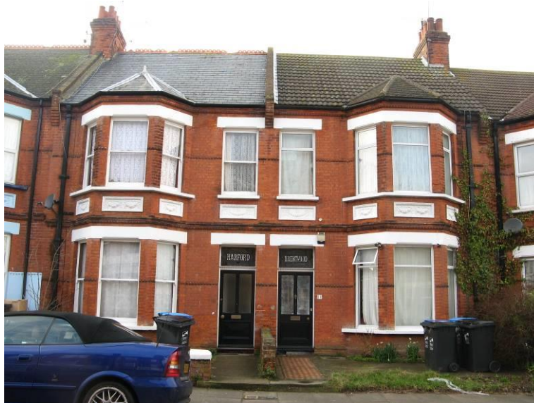
Houses like these in Warwick Road would be protected from unsympathetic alterations by an Article 4 Direction

The District Council is required to both ‘preserve and enhance’ the character of the Conservation Area. Some inappropriate alterations are visible throughout the conservation area. At the moment, however, the changes that have been made are in fairly localised locations and that on the whole the area has been fairly maintained. Whilst alterations have so far been relatively localised there is also evidence of more and more inappropriate alterations and additions within the area. In order to restrict the rights of landowners from carrying out inappropriate development an Article 4 Direction can be placed on specific buildings or areas. This enables the local planning authority to require permission for what is otherwise allowed without consent. This does not mean that permission would be refused but allows the authority to assess any potential impact to the buildings, the street scene and the conservation area.