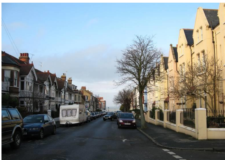
View along Norfolk Road to the sea

The Conservation Area lies within the Cliftonville West Ward of Thanet District Council. The area of Cliftonville West Ward is in the region of hectares and the population (at the 2011 census) was 7608. Demographically, the population is predominantly white European.