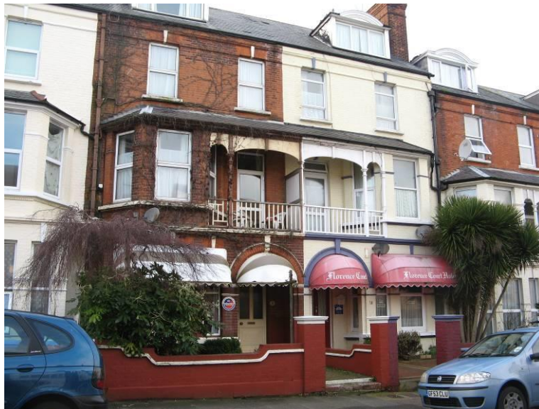
The Florence Court Hotel, Surrey Road

A number of small hotels and guest houses can also be found in the Conservation Area, such as the Florence Court Hotel (No. 18 Surrey Road) and there is what appears to be a further hotel immediately next door (No. 20). On the western side of the same road, the former Embassy Hotel (No. 50) has reverted to dwellings, and again in Surrey Road, the former Leslie Hotel (Nos. 1 and 3) has been demolished and replaced with a smaller scale residential development.