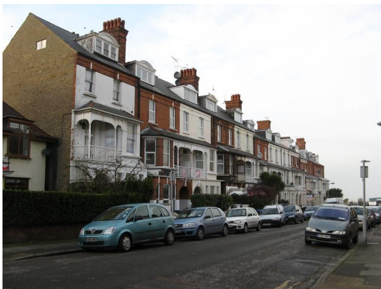
Nos. 2-24 Surrey Road

The buildings of Surrey Road are generally not so well detailed or well preserved as the other two streets, and also later in date. Nos. 2-24 are shown on the 1907 map but otherwise the remaining properties probably date from the 1920s (allowing for a gap of about ten years during World War I). Architecturally, Nos. 2-24 are the most interesting – they are substantial three storey high buildings which may have been built as guest houses as they were closer to the beach. They have first floor balconies which would have provided views down to the promenades and are built from red brick with first floor balconies. The windows were mainly sashed but very few original examples remain today. The roofs face the front and have three light dormers with rounded pediments – clearly original. Further north, but on the same side of the road, Nos. 30-46 date to the 1920s and have been much altered.