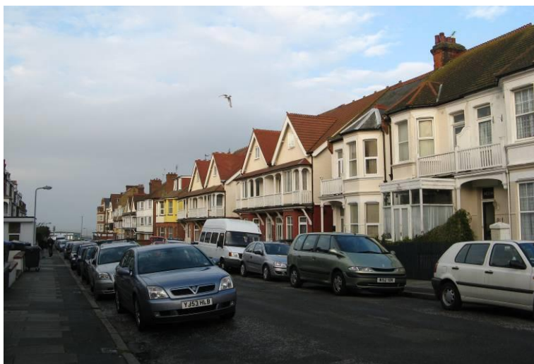
These properties in Surrey Road were mainly built in the 1920s

The buildings in Norfolk Road and Warwick Road date mainly to between 1899 and 1907, with Surrey Road being developed soon afterwards. Most of the properties are two or three storeys high and were clearly built as middle class family houses, although there are also a number of small hotels or guest houses. This development coincided with the period of Cliftonville's greatest popularity, and with the construction of many of the shops and other business premises along neighbouring Northdown Road.