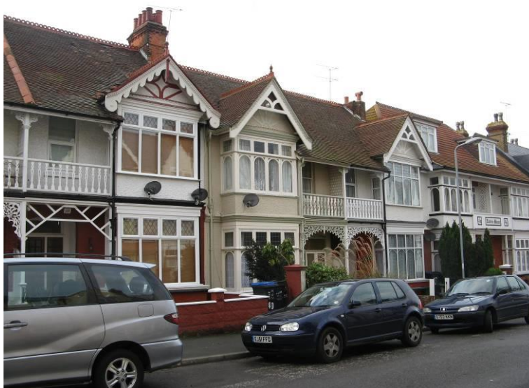
Nos. 36-42 Norfolk Road – recommended for local listing

Terraced mainly residential property dating to the early 20 th century provides the predominant building type in the Conservation Area. The buildings form groups with similar details, presumably reflecting slightly different dates of development as well as different builders. Usually, they reflect the fashion of the times with typical details of the Edwardian (rather than the Victorian) period, and they are sometimes quite decorative with attractive first floor balconies and other external joinery.