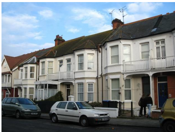
Surrey Road east side

None of the buildings in the Conservation pre-date 1879, when the area was still fields. Nearly all of the buildings in Norfolk Road and Warwick Road were built as family houses or small hotels or guest houses between 1899 and 1907, apart from Nos. 35-49, which are the only buildings in the present Conservation Area which are shown on the 1899 map. The properties in Surrey Road are more mixed – Nos. 2-26 are shown on 1907 map, Nos. 31-47 appear to have been built soon after, possibly around 1910, and the remainder are post-World War I, probably 1920s. The houses are largely arranged in uniform terraces, either two or three storeys high. The hotels and guest houses do not stand out as many were once private residences which have simply been converted or amalgamated with neighbouring properties to make larger units.