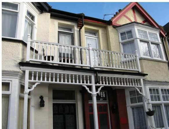
Norfolk Road east side