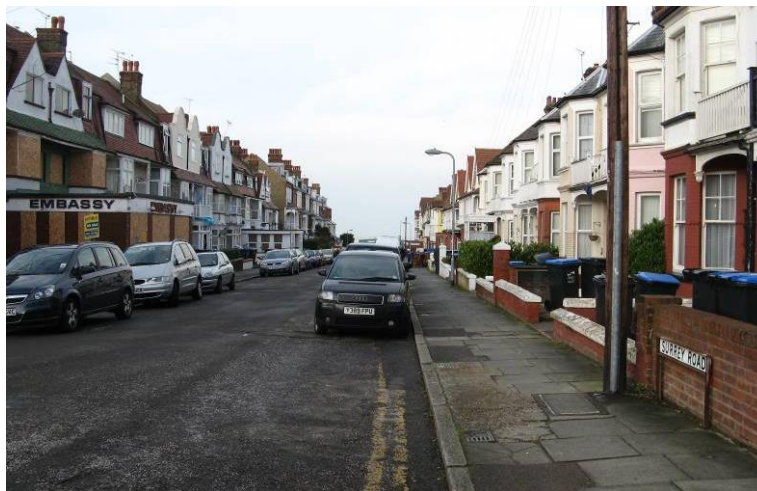
Improvements to the public realm are needed in the Conservation Area (Surrey Road)