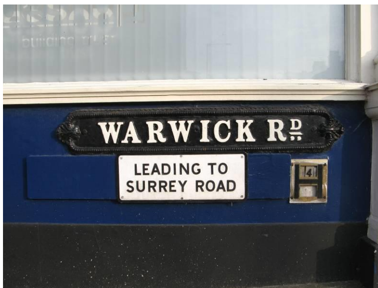
Original cast iron 'Cliftonville' nameplate for Warwick Road

There is little original floorscape in the Conservation Area apart from some setted or stone slab gutters and narrow (150 mm) granite kerbing. These can be seen in many locations in the Conservation Area. The pavements are generally covered in black tarmacadam or concrete slabs. Street lighting is provided by simple hockey-stick steel standards. Street nameplates are usually modern, with black lettering on white signs supported on black posts. Warwick Road retains an example of one of the 'Cliftonville' type nameplates made of cast iron, which can be seen at the south end of the road close to the junction with Northdown Road.