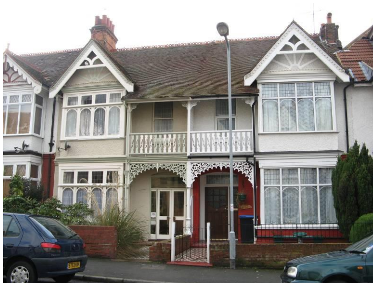
Nos. 36 and 38 Norfolk Road