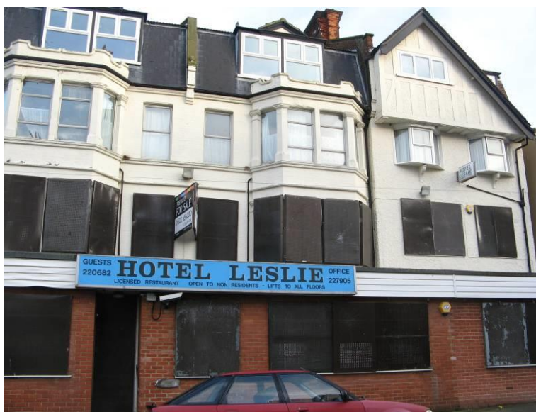
The Hotel Leslie in Surrey Road in 2010 (now demolished)

The District Council currently has a Heritage Lottery Fund funded Townscape Heritage Initiative grant scheme in the Dalby Square Conservation Area. It is possible that this scheme could be extended, or a new scheme applied for the Norfolk Road, Warwick Road and Surrey Road Conservation Area at some stage in the future. Other funding agencies, apart from the HLF, include Historic England, Thanet District Council, Kent County Council and the Homes and Communities Agency (HCA).