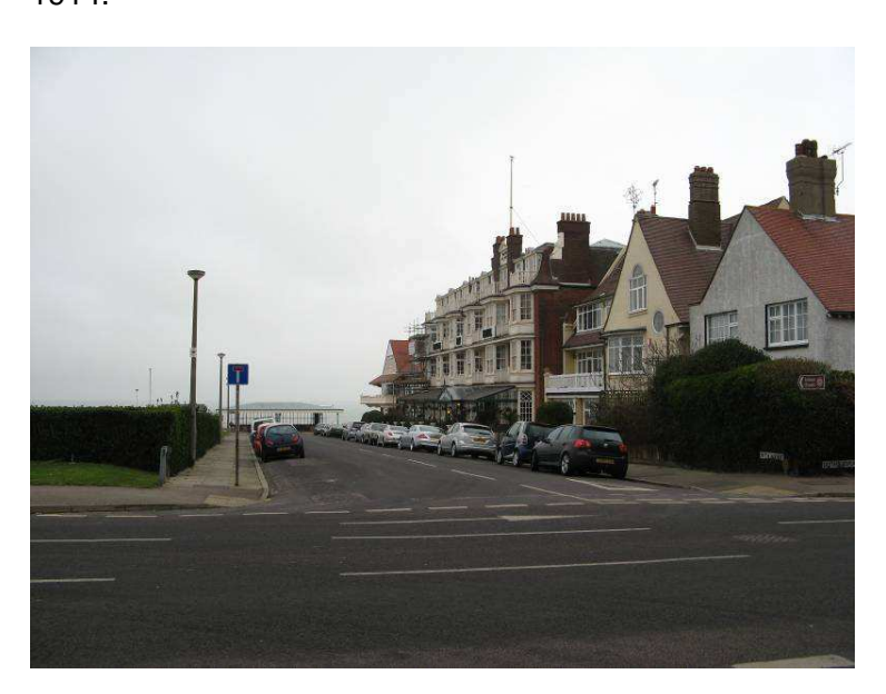
The Walpole Bay Hotel, Fifth Avenue

In the early 20<sup>th</sup> century the Queen's Highcliffe Hotel was created to the north of Queen's Parade. The map of 1907 shows two separate blocks of buildings, then used as small hotels and a ladies' college. To create the prestigious entrance required for the new hotel, the gap between them was filled in and an imposing central tower was built, below which were a banqueting hall and a ballroom. The hotel offered 150 bedrooms, and between the wars, evening dress and ballgowns were essential for the eight course gourmet dinners. The Butlin organisation took over the hotel in 1955 but with limited success and in 1980 the buildings were demolished to be replaced more recently by the Queen's Court flats. Although the Queen's Highcliffe Hotel was a substantial building, it was smaller than the Cliftonville Hotel, located just outside the Conservation Area on the east side of Dalby Square. The Grand Hotel and St George's Hotel were also added in the late 19<sup>th</sup> century (they are shown on the 1907 map) and although they survived until quite recently, they have now been demolished and their sites either redeveloped for flats (Dickens Court and Darwin Court) or left cleared and vacant. A further hotel, the Walpole Bay Hotel, was added in 1914.