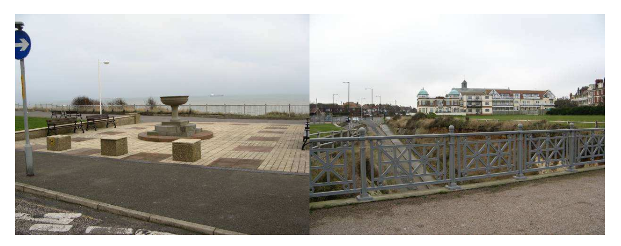
The Bourner Memorial

councillor who died in World War 1. The Memorial lies to the immediate north of Second Avenue and provides a focus to walkers passing along the Queen's Promenade.