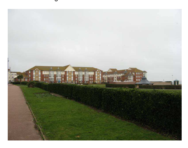
View over The Oval to Queen's Court

The Oval is in fact a circular open-air theatre with a modern bandstand in the middle which lies at a lower level to provide sight lines. Whilst there are vestigial remains of historic light fittings, the majority of the features are modern, with tarmacadam, concrete paving and very utilitarian fencing and other boundaries.