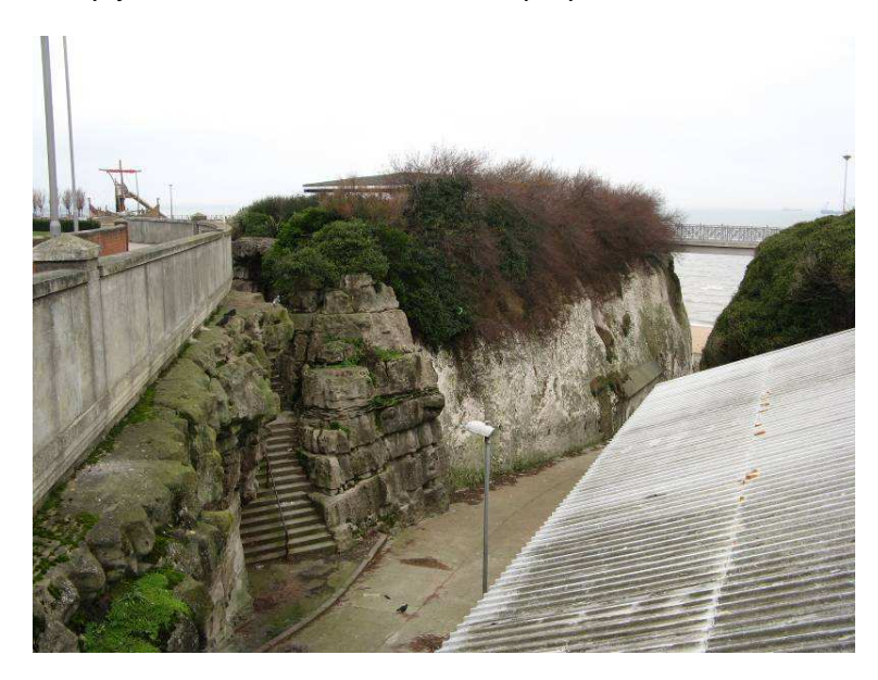
Newgate Gap cuts through the chalk cliffs

A slight south to north drop in ground level reinforces the opportunities for long views over the seascape to the north of these cliffs. To the south of Northdown Road, the land falls steeply – this is most evident in the proposed Grotto Hill Conservation Area.