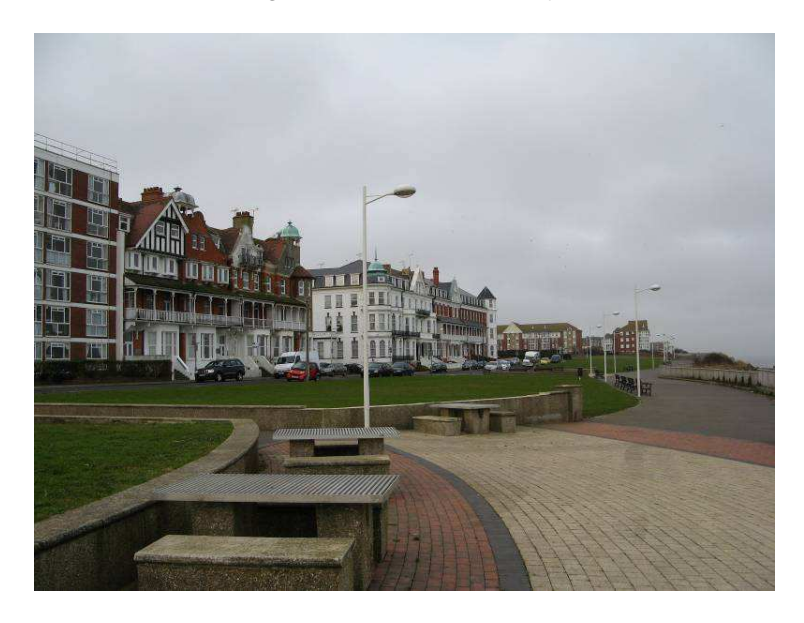
Well designed public realm features on Queen's Parade

The large amount of public open space in the Conservation Area means that the public realm, including pavements, roads, street lighting, street furniture, signage and other features of local significance, is extremely important.