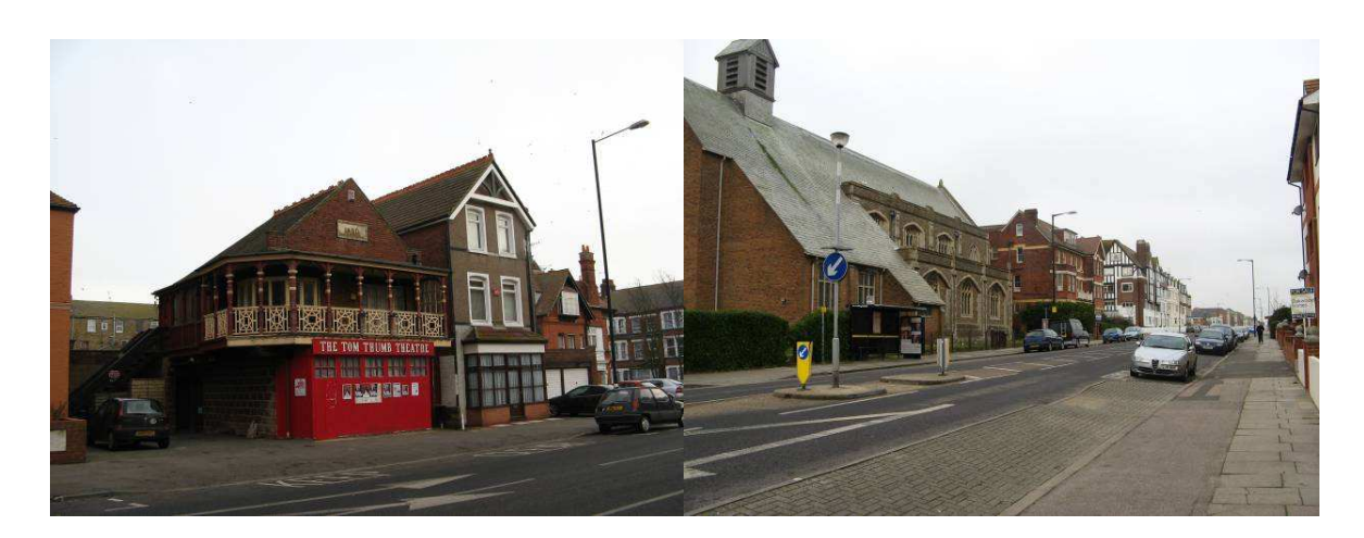
The Tom Thumb Theatre