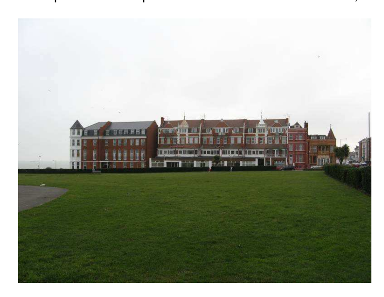
View from The Oval to First Avenue

In 1900 the Cliftonville Hydro Hotel with 110 bedrooms was opened, later being renamed the Grand Hotel (from 1956 this formed part of Butlins). By 1900 a grid pattern of streets off Northdown Road had also been completed (Edgar, Sweyne, Godwin, Harold, Norfolk and Surrey Roads), all with a mixture of houses and guest houses along them. In 1913 'Bobby's' was opened as a department store in Northdown Road, although it closed in 1973.