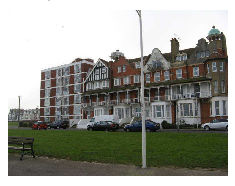
The 1960s flats facing Third Avenue and Queen's Parade