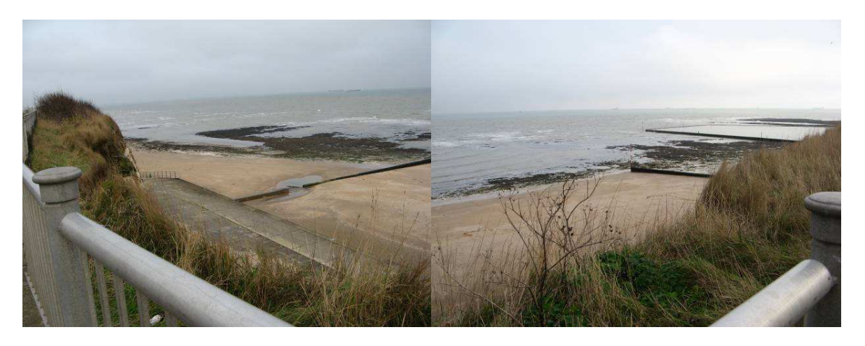
Views of the sea and beach from Queen's Promenade

The open spaces are contained by the high chalk cliffs to the north, with the beaches below, and by a long road (Ethelbert Terrace, Ethelbert Crescent, Queen's Parade and Eastern Esplanade) to the south. This runs almost parallel to the cliffs. Newgate Promenade and Queen's Promenade is a long pedestrian-only footpath which runs at the top of the cliffs from the public car park next to the Lido to Hodges Gap and beyond. This road appears to have existed by 1872 although it terminated just beyond the junction with Harold Road.