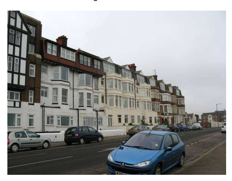
Nos. 25-39 Eastern Esplanade

More unusual buildings within the Conservation Area include the Florence Rose Tea Rooms and the adjoining Tom Thumb Theatre, which was originally built as a stable. These are only two storeys high and much smaller in scale. The Tea Rooms are constructed in red brick which has been painted, and retains a distinctive first floor balcony with Chinoiserie railings and a corner turret with a steeply pointed tiled roof. The adjoining theatre has a similar balcony with matching railings and is dated 1896 on the wide brick gable which faces the street. The ground floor elevation appears to have been somewhat altered. It can be safely assumed that these were built as a pair as increasing visitor numbers generated the need for additional facilities.