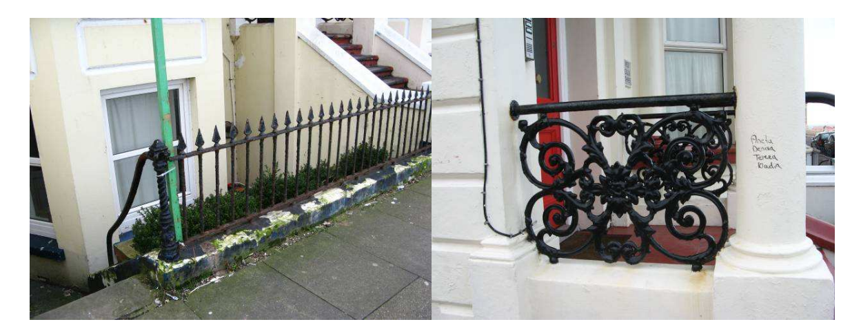
Cast iron railings on Ethelbert Crescent