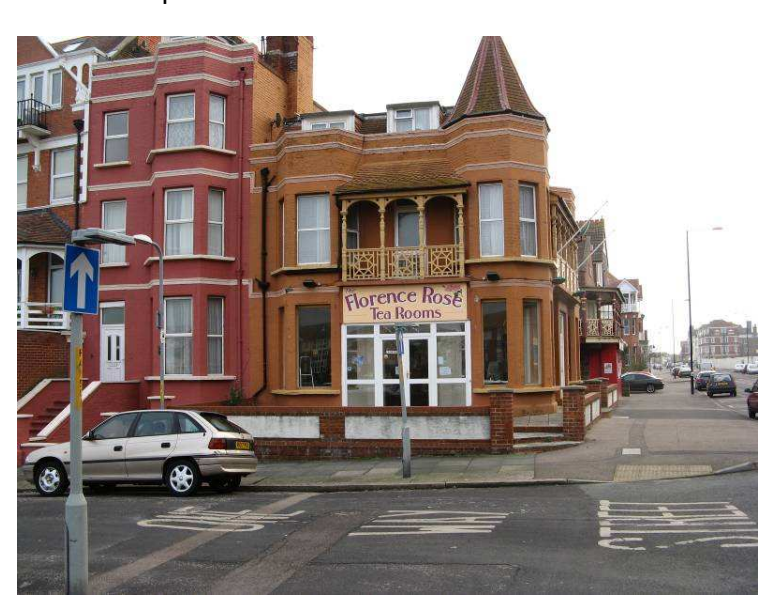
The Florence Rose Tea Rooms

Cliftonville reached the zenith of its popularity between 1890 and 1905, although surprisingly the map of 1899 confirms that what is now the proposed Cliftonville Cliff Top_Conservation Area had still only been partially developed. The Clifton Baths an adjoining Artillery Hall are still evident, with an open space between them and the Queens Highcliffe Hotel which was located to the north of Queen's Parade. At this point the cricket field appears to be called an 'Esplanade' and its shape reflects the earlier cricket field, which was converted into an amphitheatre in 1897. This amphitheatre (called the Oval) was to become an important centre for open-air concerts and other events.