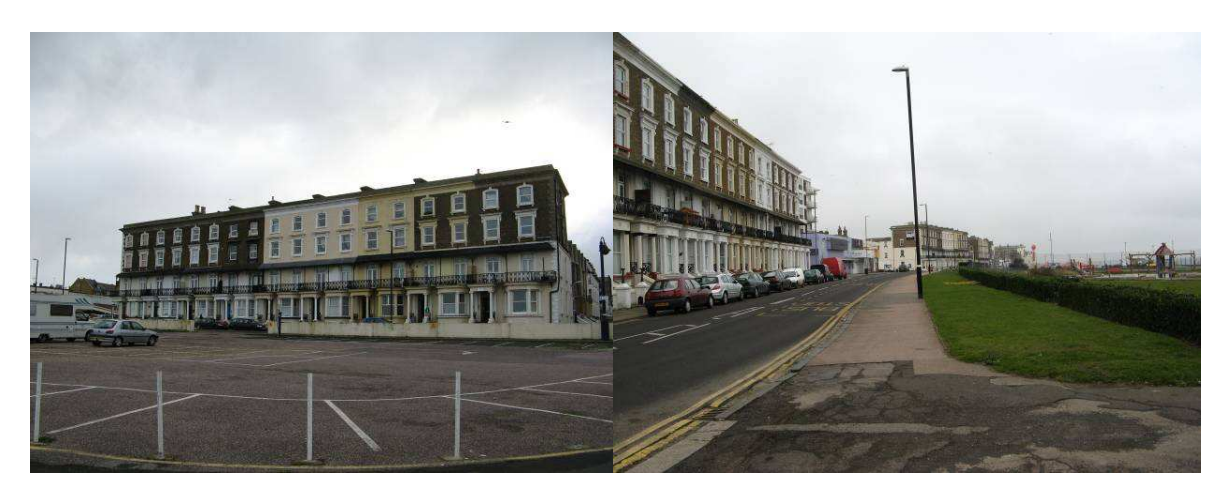
The area in front of Ethelbert Crescent is in urgent need of improvement

The public realm includes all of the space between the buildings in the Cliftonville Cliff Top Conservation Area which is not privately owned, such as the roads, pavements, street lighting, street name plates, and street furniture (litter bins, seats, and other features). Whilst some small areas have already been improved, there are other areas where enhancements are urgently required.