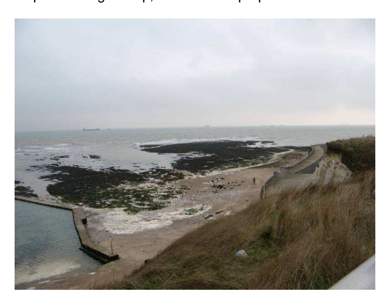
View from Queen's Promenade over the chalk cliffs

Margate is located over solid chalk, with high chalk cliffs rising to either side of the beach and harbour in the centre of the town. The Dane valley rises gently southwards through the town from this beach. Cliftonville lies on roughly level ground on the eastern cliff tops above the town about 20 metres above sea level, although cuts have been made through the cliffs in previous centuries to allow access to the sandy beaches below. Two of these, Newgate Gap and Hodges Gap, lie within the proposed Cliftonville Cliff Top Conservation Area.