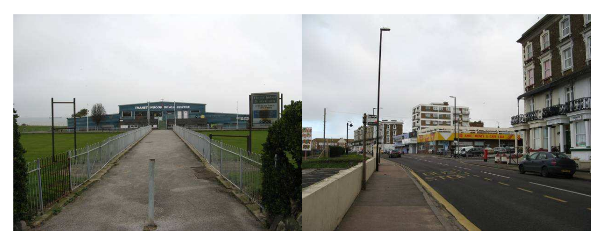
View to the Thanet indoor Bowls Club

The Conservation Area is in a variety of uses with a mixture of leisure-related facilities and residential properties being evident. The Lido is now a club (The Cliff Bar) but many of the other buildings on the site appear to be vacant. The adjoining sea water swimming pool is now silted up. The Little Oasis Crazy Golf Course, a children's adventure playground, the Oval concert area, and the Thanet Indoor Bowls Centre with its adjoining open-air bowling greens, take up much of the open space between the residential properties. These are focused in Queens Court, a development of blocks of flats which sits centrally in the long thin Conservation Area, and the other more historic residential properties facing First and Second Avenues. A further, and much larger complex of buildings, stands on the southern boundary of the Conservation Area on the site of the Cliftonville Hotel next to Dalby Square. This was built in the late 1960s and also provides a variety of leisure uses.