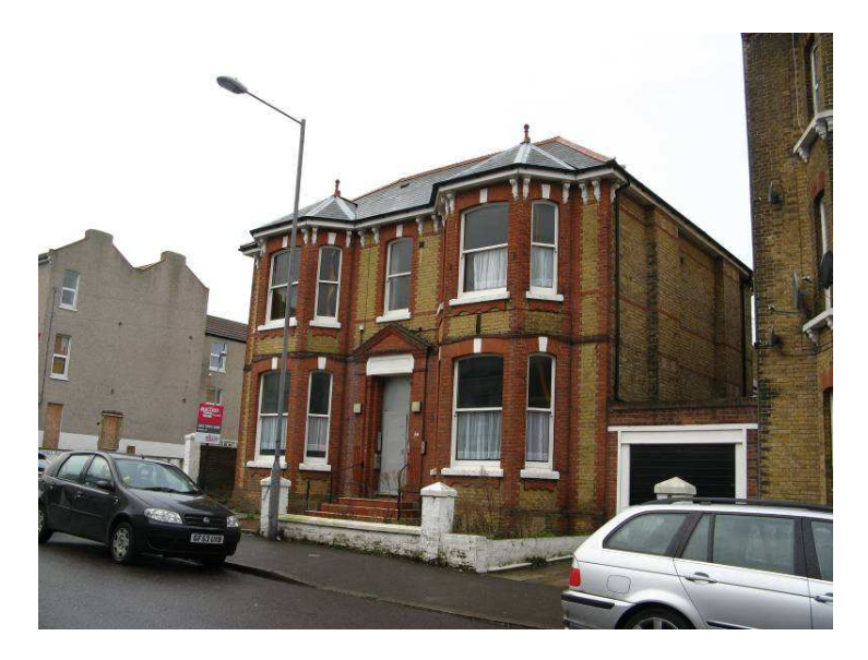
No. 38 Sweyne Road

The remaining houses in this group as far as the junction with Stanley Road are quite mixed, with an initial group of three and a half storey painted brick houses with full height canted bays and concealed roofs, leading on to a number of yellow brick with red brick dressings properties which presumably are slightly later in date. No 36 retains its original front door with two curved glazed panels over a single heavily moulded panel below. Next door, No. 38 is an unusual building in that it is (just) a free standing double fronted two storey villa, with double height canted bays, Gothic detailing, and a pitched roof facing the street. This property is unusually well preserved with its original sash windows and slate roof covering.