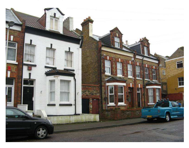
Houses in Stanley Road

Terraced residential property dating to the late 19<sup>th</sup> century provides the predominant building type in the Conservation Area. None of the properties in the Conservation Area are shown on the map of 1879 apart from Nos. 1-4 Edgar Road and the Clubhouse in Percy Road, and it can therefore be safely assumed that most of the buildings date to between the very late 1870s and 1899, when the map of that date confirms the completion of nearly all of the street frontages. The largest and highest status buildings are to be found in Edgar Road, with slightly smaller terraced houses, with less decoration, in Gordon Road and parts of Sweyne Road. All of these are largely stuccoed with Italianate details (for the earlier examples) or more Gothic details (for the houses which date from around the 1890s onwards). Stanley Road and St Paul's Road contain mainly paired or terraced brown brick houses, stylistically a little later in date (1890-1900).