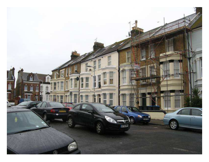
Dominant car parking in Gordon Road

On-street car parking is a dominant in many locations, particularly in Edgar Road and Gordon Road, most notably around the green. It may be possible to reduce the impact of on-street car parking by the creation of carefully designed parking bays, which could incorporate planting and new street trees (which are almost totally lacking in the area at the moment). However, any such scheme would need to be allied to improvements in Cliftonville in general, including (possibly) the introduction of a Residents' Parking Scheme. Fast moving through traffic might also be reduced by such measures, and a further improvement might be the creation of new one-way systems, which would need to include very carefully detailed traffic calming measures. Over-dominant road markings, barriers, and safety rails must all be avoided as these are alien intrusions in any conservation area.