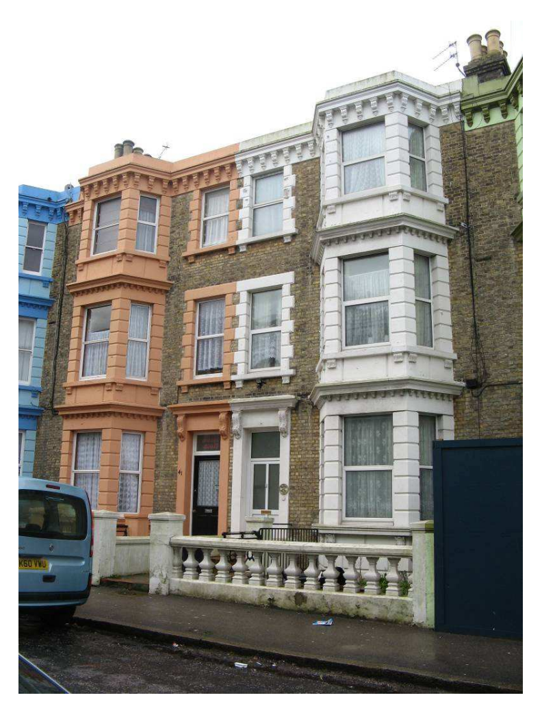
Typical 'positive' property in Edgar Road

the special interest of the conservation area. In the Edgar Road and Sweyne Road Conservation Area, most of these buildings date to between the 1870s and the early 20<sup>th</sup> century, where they form cohesive terraces with well preserved elevations. Slightly later buildings of slightly lower quality can be found in St Paul's Road, dating to the 1920s or 1930s (Nos. 10-18 even), but is considered that these are also positive although careful restoration of their front facades would be welcome. Similarly, Sweyne Road contains several groups of rather altered historic buildings where improvements are needed, such as the removal of the ground floor extensions to Nos. 40/42.