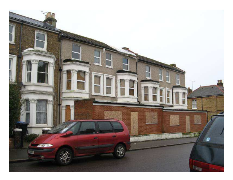
Inappropriate 'build-outs' in Sweyne Road

The closely packed nature of the buildings within the proposed Conservation Area means that there are few, if any, sites where new development might be possible although the replacement (in time) of some of the 20<sup>th</sup> century buildings of little merit would be welcome. There are no vacant sites so it is likely that new development will be limited to extensions to existing buildings or the replacement of modern buildings. In a number of locations, flank walls, flat roofed garages, and poorly maintained back access alleys make a particularly negative contribution to the street scene.