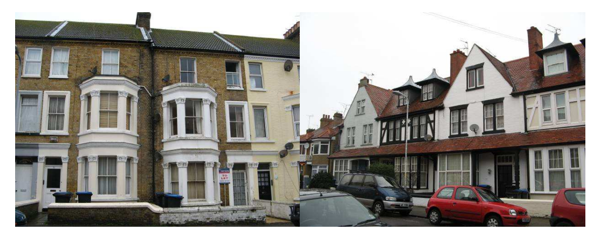
Gordon Road houses with original windows

The terraced houses which face Gordon Road are three storeys high without half basements. They also have canted bay windows but these are only two storeys high, with the sashes separated by brick piers with capitals decorated with leaf mouldings in the Gothic style. On the west side of the road, the eaves retain corbelled brick details with pitched roofs facing the street. These are usually covered in modern tiles but originally would have been slate – a few examples remain. On the east side of the road, the pitched roofs are partially concealed by moulded parapets. Some of the houses have converted their attics, so roof lights or dormers have been added to these front-facing roof slopes. Simple brick chimney stacks, often with ten original clay pots, are a notable feature. A few areas of brown brick can be seen, but mostly the buildings are painted a cream colour which provides a more cohesive streetscape although the occasional house has been painted a less appropriate colour, such as bright blue. Many of the original four panelled timber front doors remain