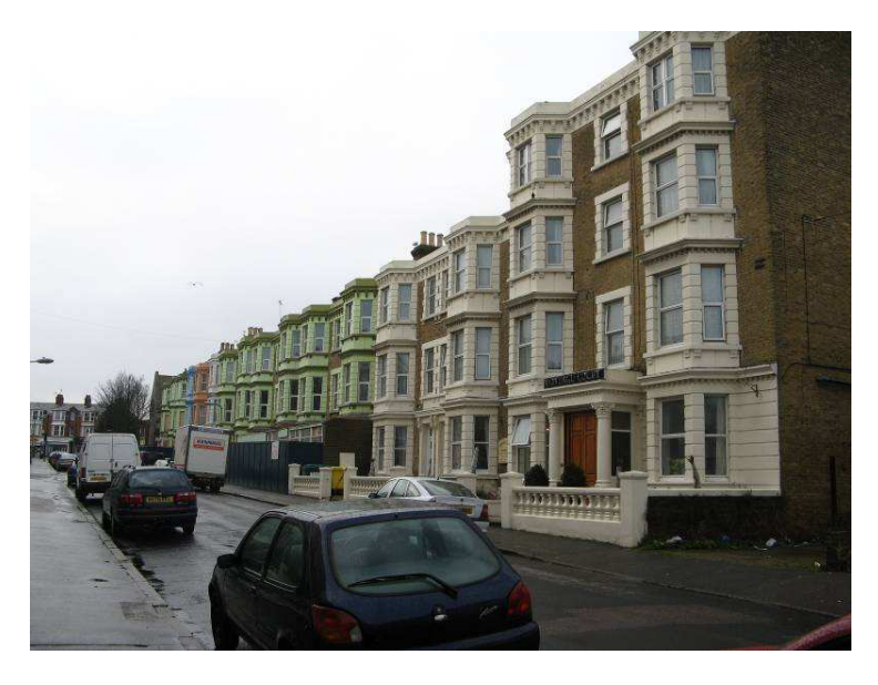
West side of Edgar Road

The plan form of the Conservation Area is simple and was constrained by Dalby Square to the west, Northdown Road to the south, and the seaside promenades and other open spaces to the north. The two main streets, Edgar Road and Sweyn Road, lie at right angles to the sea although this pattern was slightly changed in the centre of the Conservation Area in Gordon Road. Here, the space between the long terraced buildings on either side of the road was widened to create a small raised 'green', which has been landscaped with plants