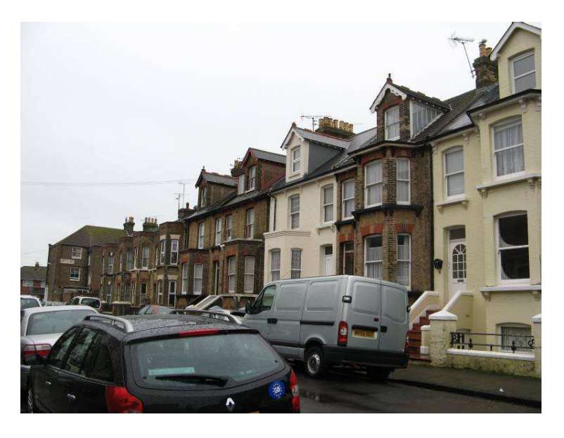
Many of these houses in St Paul's Road retain their original details

Many of the properties in the Conservation Area are not in use as family dwellings (i.e. as a single unit) but have been divided into flats or HMOs. For these buildings, permitted development rights are already much lower, so, for instance, planning permission would normally be needed to insert new plastic windows or to change the roof material. For these buildings, an Article 4 Direction could still be used to control front boundaries, the creation of car parking spaces, and external redecoration. It can also be used to control colour, so it would be possible to limit external painting to a certain palette of colours, to provide greater cohesiveness to the front elevations – for instance, by insisting upon shades of cream or an off-white colour for stucco and brickwork.