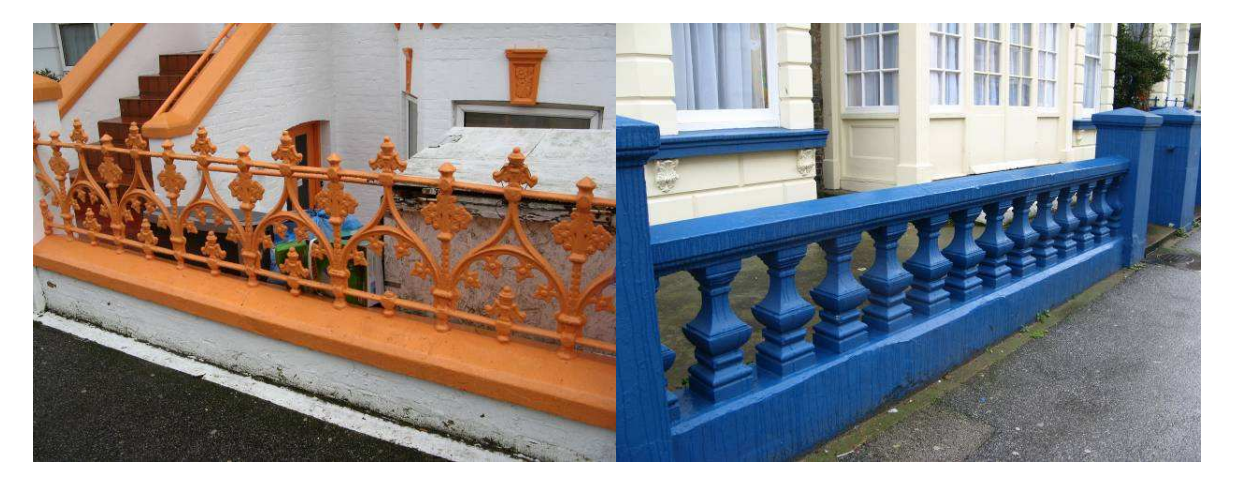
Railings in front of No. 9 Edgar Road

The orientation of the buildings to the street, with small front gardens or basement areas, means that front boundaries are extremely important in the Conservation Area although unfortunately they have been neglected, removed or altered in many locations. Where there are basements, the front steps are often particularly important and many are bounded by their original plinth walls with cast iron railings of various designs. Examples can be seen on the south side of St Paul's Road (Nos. 1-17 odd) where the houses have half basements defined by a low brick plinth walls and cast iron railings with very decorative 'flower' panels set into short spiked uprights with spear heads (similar railings can be seen in the Ethelbert Road and Athelstan Road Conservation Area). No. 9 Edgar Road has highly decorative 'Gothic' cast iron railings protecting the basement front area – these are in good condition but painted an unfortunate orange colour. Elsewhere, many of the front boundaries are simply low brick walls (often painted), with moulded stone copings, as can be seen throughout Gordon Road.