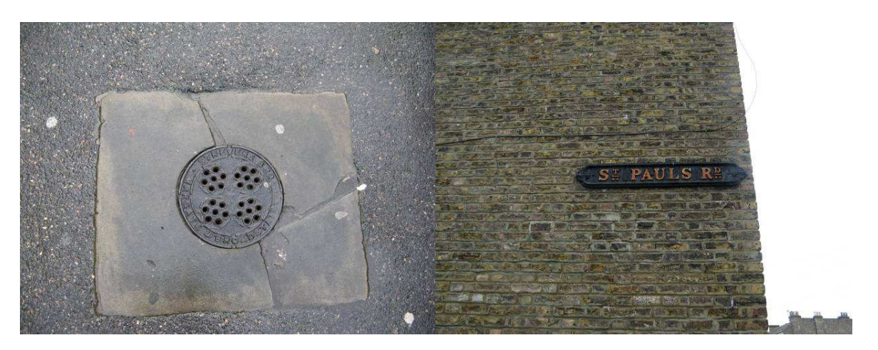
Cast iron coal hole cover in Edgar Road

There is little original floorscape in the Conservation Area apart from some setted or stone slab gutters and narrow (150 mm) granite kerbing. These can be seen in many locations in the Conservation Area. Decorative cast iron coal holes do remain in the pavements outside the houses in several locations, often set into the original sandstone flag. One example on Edgar Road is marked Stevens Bros Margate and Broadstairs .