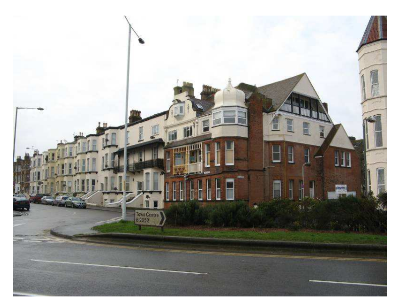
Corner building, Sweyne Road

St Paul's Road contains the Community Hall and adjoining former school, which are described in greater detail in the Management Plan. The Hall lies next to a short terrace (Nos. 1-17 odd) of two storey late 19<sup>th</sup> century houses which are built from brown brick with red brick dressings similar to the properties in Stanley Road, although a few have been painted. Again, many of these have original dormers with carved barge boards, and, below, there are canted bay windows to the half basement and ground floors. Decorative cast iron railings protect the small front areas. Nos.1-4 consec. are similar but smaller, with no basements and more shallow pitched roofs which are partially concealed by brick parapets which are decorated with corbelling.