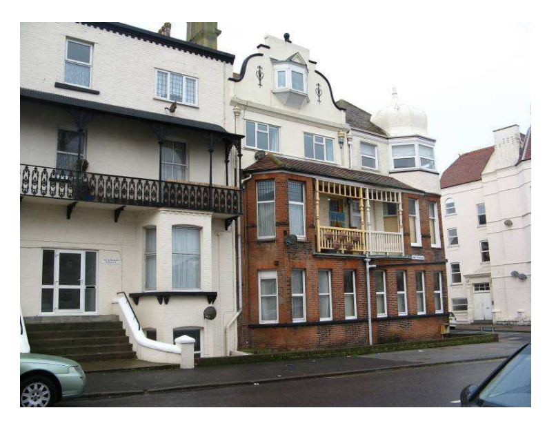
Properties at the seaward end of Sweyne Road

The proposed Edgar Road and Sweyne Road Conservation Area abuts the already designated Dalby Square Conservation Area to the west, and the proposed Northdown Road Conservation Area to the south. To the immediate north, the proposed Cliftonville Cliff Top Conservation Area lies along the seafront, separating the proposed Edgar Road and Sweyne Road Conservation Area from the promenade and beach.