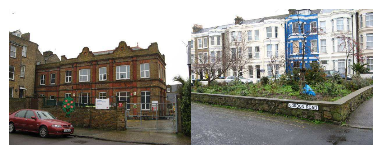
The Sure Start Children's Centre, St Paul's Road The Gordon Road green

The District Council will work with the local community to produce a new Local List for Cliftonville.