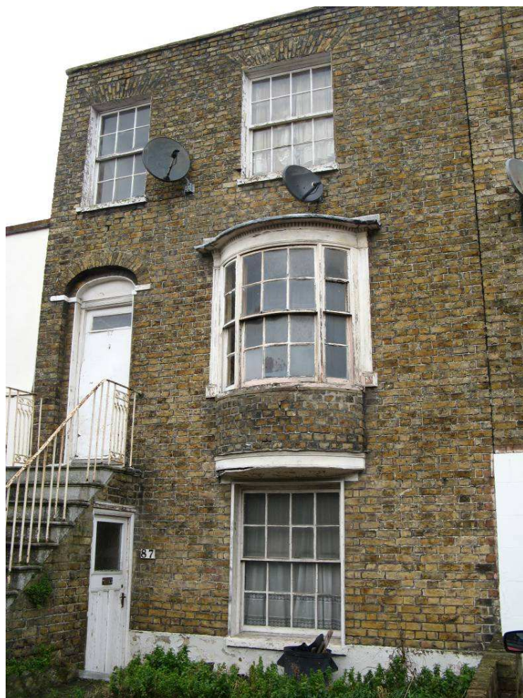
No. 87 Dane Road