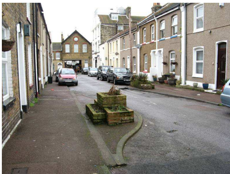
View along Grotto Road

Views along Clifton Road, Brockley Road, and Grotto Road are enclosed by the terraced houses on either side of each street with no special focal points. Brockley Road does contain a small former chapel or hall, and Grotto Road similarly contains the slightly taller Davenport House, both of which add some liveliness to the otherwise very simple front facades. A gable on the brick part of the Ice Factory and Cold Store forms a stop-end to the view westwards along Grotto Road.