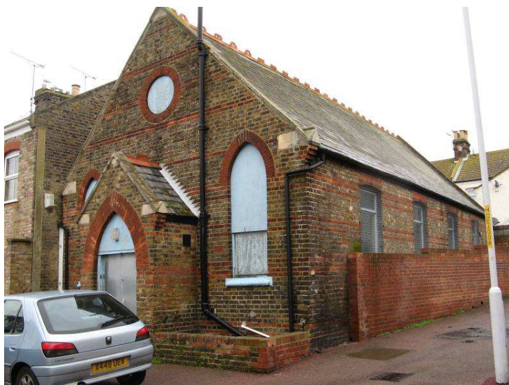
Hall in Brockley Road

There are two specific 'Buildings at Risk' in the Conservation Area : the former non-conformist chapel or hall in Brockley Road, which is currently boarded up, and the industrial warehouses between Grotto Gardens and Dane Road (only one out of the three buildings appears to be in use and reasonably well maintained).