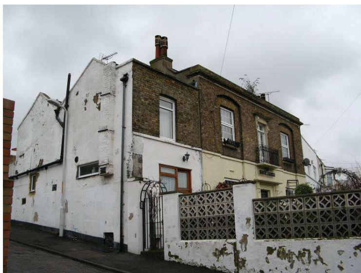
Rose Lodge is in urgent need of improvements