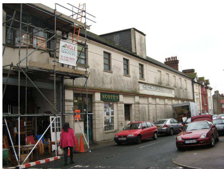
The former Ice factory and Cold Store, now used as an antiques and furniture shop

The Conservation Area is principally in residential uses, with most of the properties being modestly sized terraced houses which line all of the six streets which make up the Conservation Area. Whilst a detailed survey has not been carried out, the majority of the properties appear to be in use as family houses rather than as flats or HMOs (Houses in Multiple Occupation).