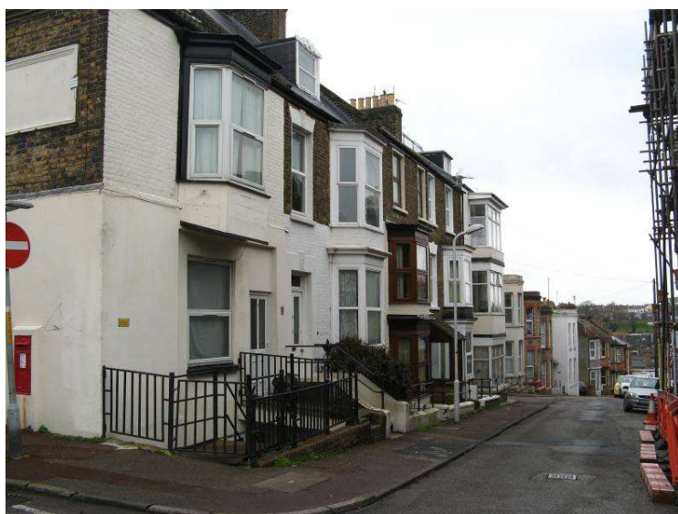
View down Grotto Hill

The Grotto Hill Conservation Area forms part of the distinctive grid pattern of streets which were developed in the late 19 th century as part of Cliftonville, a residential suburb located on the eastern edge of the old fishing village of Margate. Between 1880 and 1910 Cliftonville became a very popular and upmarket centre for visitors, who were drawn to its many hotels and guest houses, all located in close proximity to the beach. Large private houses and several schools were also built in the area. Accommodation was needed for the many workers who serviced these facilities and from the 1860s onwards new artisan houses were built on the south side of Northdown Road in a compact area overlooking the Dane valley. These houses are terraced in form and generally just two storeys high with small back gardens. Together, they form an area of distinct character which is enlivened by the inclusion within the Conservation Area of a large former Ice Factory and Cold Store, which is located on the corner of Grotto Hill and Bath Place. Of note is the falling topography, with a steep drop down Grotto Hill providing long views across the Dane valley.