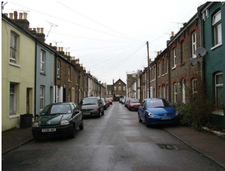
Terraced houses in Brockley Road

The proposed Grotto Hill Conservation Area was built on open fields as part of the development of Cliftonville between the 1850s and late 19 th century, when the streets to either side of Northdown Road were laid out in a grid pattern, those on the north connecting the commercial core of Cliftonville with the seaside activities along the promenades. To the south, the streets which now form the Conservation Area adjoined Bath Road, a long straight road which dropped down the hill from what was then called Northumberland Road (now Northdown Road), containing an area of very mixed development. The streets within the Conservation Area therefore follow the orientation of Bath Road and Northdown Road, creating a tightly planned series of short streets lying parallel to each other which are linked in the west by Clifton Gardens and its continuation, Grotto Hill. Whilst Brockley Road and Grotto Road are connected by a car-accessible street, the continuation of Grotto Road up the hill on the east side of the Conservation Area has been blocked up and a pedestrian-only route provided. Of note is the steepness of the south-facing slope, most obviously appreciated along Grotto Hill and this second section of Grotto Road, with the three main streets between them being roughly level as they follow the contours along this hill.