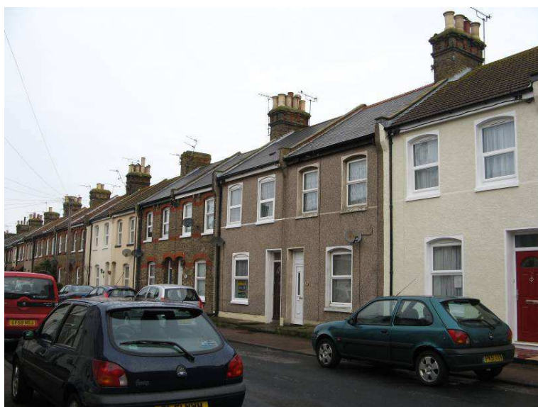
'Positive' terraced houses in Clifton Road

The identification of these 'positive' buildings follows advice provided within English Heritage's Understanding Place: Conservation Area Designation, Appraisal and Management , which provides a helpful list of criteria for their selection. The guidance advises that a general presumption exists in favour of retaining those buildings which make a 'positive' contribution to the character or appearance of a conservation area.