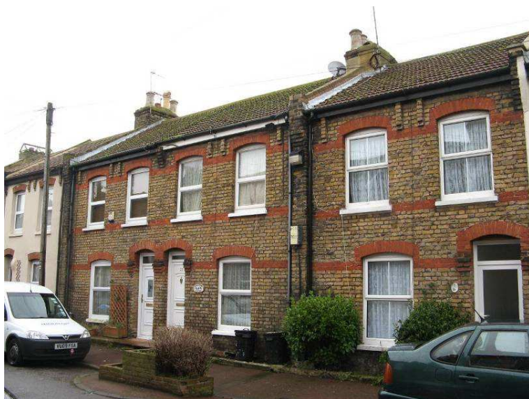
Houses in Grotto Road

with brick chimney stacks and tall clay pots providing some articulation, although it is regrettable that many of these roofs have been recovered using concrete tiles.