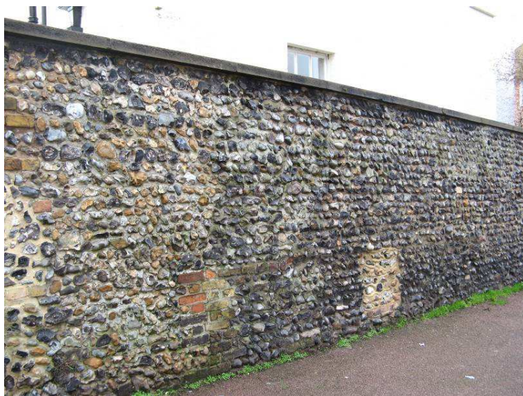
Beach flint wall in Clifton Place

The most common boundaries in the Conservation Area are provided by brick walls of varying heights, the brick being a London stock which starts as a yellow colour but which weathers to a dark brown. There are several examples of the use of beach flints to build walls of up to two metres in height, such as in Clifton Place (but just outside the Conservation Area boundary), in Grotto Gardens, and in the upper part of Grotto Road.