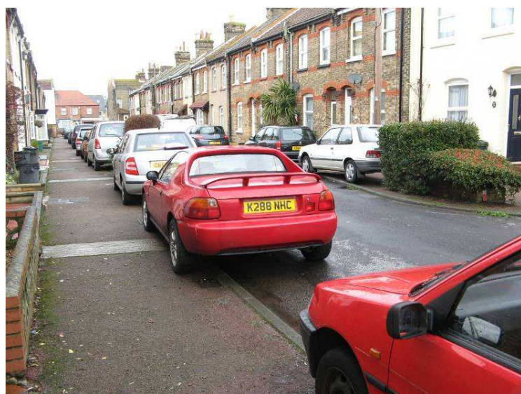
Parking on the pavements in Clifton Road

On-street car parking is dominant throughout the Conservation Area, with clearly not enough spaces for the number of residents' vehicles. It may be possible to reduce the impact of on-street car parking by the creation of carefully designed parking bays, which could incorporate planting and new street trees (as suggested in para 3 above). However, any such scheme would need to be allied to improvements in Cliftonville in general, including (possibly) the introduction of a Residents' Parking Scheme. The existing road system should be retained. Over-dominant road markings, barriers, and safety rails must all be avoided as these are alien intrusions in any conservation area.