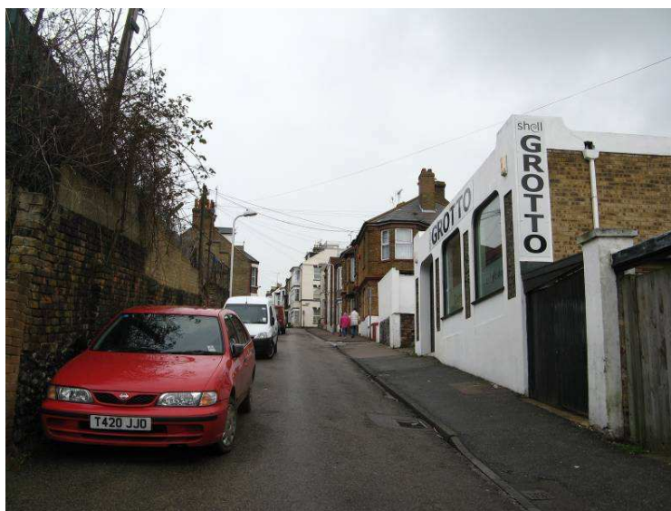
View up Grotto Hill past the entrance to the listed grotto

Margate is located over solid chalk, with high chalk cliffs rising to either side of the beach and harbour in the centre of the town. The Dane valley rises gently southwards through the town from this beach. Cliftonville lies on roughly level ground on the eastern cliff tops above the town about 20 metres above sea level, although cuts have been made through the cliffs in previous centuries to allow access to the sandy beaches below. Two of these, Newgate Gap and Hodges Gap, lie within the proposed Cliftonville Cliff Top Conservation Area. A slight south to north drop in level reinforces the opportunities for long views over the seascape to the north of these cliffs.