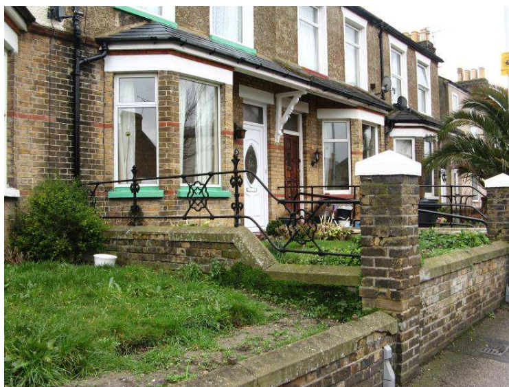
Gardens in Grotto Gardens with original cast iron railings

forecourt and steps. Some of these properties retain their original cast iron railings which are usually very simple – just a top and bottom rail with moulded supporting posts.