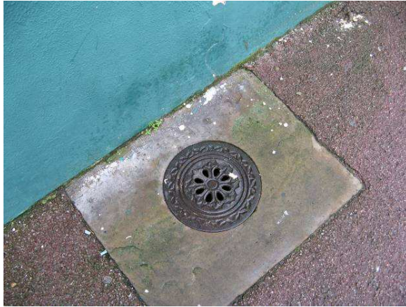
Cast iron coal hole in Grotto Road

modern, with white lettering on black background (or vice versa), and are often fixed to the buildings. Brockley Road retains an example of one of the 'Cliftonville' type nameplates made of cast iron with rounded edges, which can be seen at the western end of the road close to the junction with Grotto Hill. This matches other examples which can be found throughout Cliftonville and presumably date to the late 19 th century.