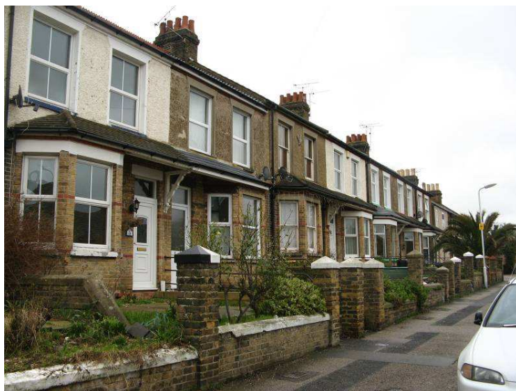
Houses in Grotto Gardens

Subject to public consultation, it is anticipated that the proposed Grotto Hill Conservation Area could be designated during 2011 by Thanet District Council. Other conservation areas may be designated in Cliftonville as part of a review of the Cliftonville area which commenced in the summer of 2010. This Character Appraisal and Management Plan will be subject to a six week public consultation between (fill in dates) after which any necessary amendments will be made to the document and the accompanying mapping. The final Appraisal and Management Plan will be approved by the Council in due course as a material document for development control purposes.