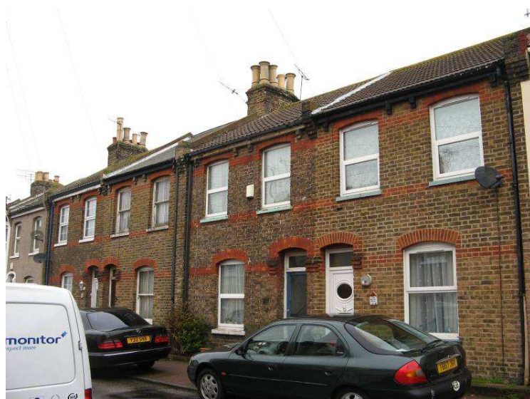
No. 19 Brockley Road (on left) is one of the few houses to retain its original windows

Most of the houses in the Conservation Area are in use as family dwellings (i.e. as a single unit) but the occasional property has been divided into flats or HMOs. For these buildings, permitted development rights are already much lower, so, for instance, planning permission would normally be needed to insert new plastic windows or to change the roof material. For these buildings, an Article 4 Direction could still be used to control front boundaries, the creation of car parking spaces, and external redecoration. It can also be used to control colour, so it would be possible to limit external painting to a certain palette of colours, to provide greater cohesiveness to the front elevations – for instance, by insisting upon shades of cream or an off-white colour for stucco and brickwork.