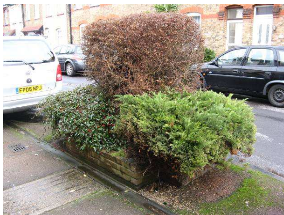
'Build-out' in Clifton Road