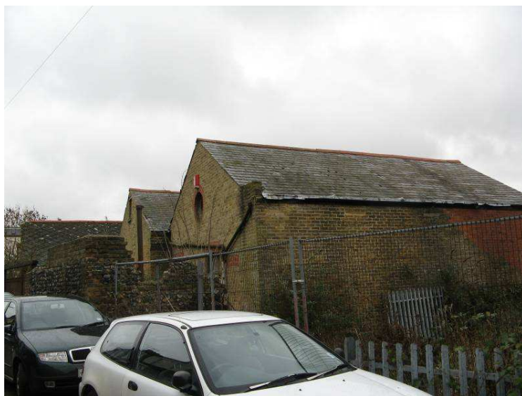
Former industrial buildings between Grotto Gardens and Dane Road

The closely packed nature of the buildings within the proposed Conservation Area means that there are few, if any, sites where new development might be possible although the replacement (in time) of the poorer quality 20 th century buildings would be welcome. The only truly vacant site, at the end of Grotto Gardens, has recently been redeveloped with three terraced houses which are currently being sold. The redevelopment of the industrial buildings between Grotto Gardens and Dane Road may come forward at some stage although at least one of the three buildings appears to be in use. Otherwise, there are no vacant sites so it is likely that new development will be limited to extensions to existing buildings or the replacement of these modern buildings. In a number of locations, flank walls, flat roofed garages, and poorly maintained back access alleys make a particularly negative contribution to the street scene.