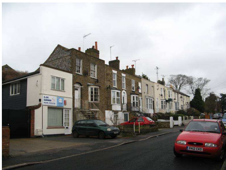
Houses in Dane Road

Dane Road provides the earliest buildings in the Conservation Area but they are also the most altered, although two examples remain (No. 69 and No. 87) which indicate how they were originally detailed. No. 69, which is currently called Rose Lodge, is an unusual (in this Conservation Area) example of a symmetrical, two storey villa with no basement which is built from brown brick which would once have been more of a yellow colour. It has a three bay projecting front with a first floor balcony edged by the original cast iron railings, although unfortunately all of the windows and the front door have been replaced using modern materials. The double pile roof is concealed from the front by a parapet. Once detached, it is now joined to the terrace of houses on the east side by a modern building of no special merit.