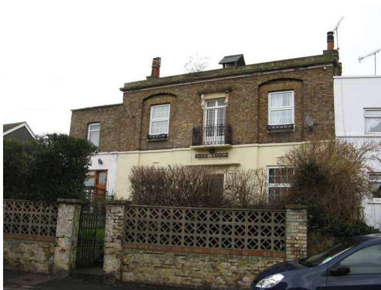
Rose Lodge, Dane Road

There is no indication of any structure close to the site of the shell grotto, which appears to lie within a small parcel of open land to the immediate west of these L-shaped buildings. It is possible that the shell grotto was built at the late 18 th or the early 19 th century within the garden of Dane House, following the example set by Alexander Pope (and others) in the mid 18 th century – Pope built a similar shell grotto in Twickenham in the early 1740s. As Margate expanded outwards from the early 19 th century onwards, the location of Dane House would have become less salubrious, and it is possible that the function of the house may have changed, hence the addition of farm buildings between the grotto and the house. It is therefore perhaps not surprising that by 1845 Dane House had been demolished and a row of houses had been built facing the north side of Dane Road (now Nos. 69-101 odd), which led to Dane Farm at the eastern end of the road. These must date to between 1821 and 1845. The shell grotto was subsequently rediscovered by a schoolmaster and his sons who were digging in their back garden. They must have been living at what is now Rose Lodge, No. 69 Dane Road, which is located on what was once part of the plot of land to the west of Dane House.