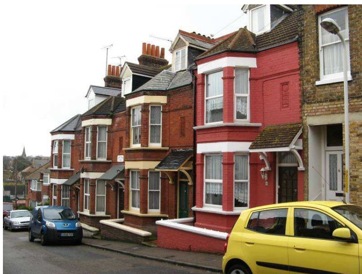
Unusual red brick houses in Grotto Hill

out to replicate stone. The effect is a kind of stripped-down classical which could well be the result of a refacing between 1910 and the 1920s.